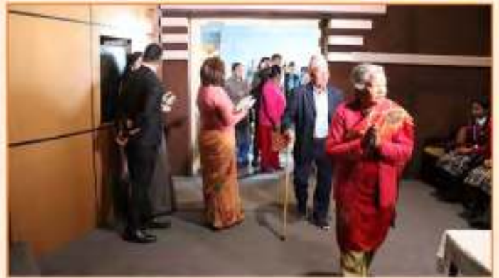
Grandparents of Grade V visiting Buddha Hall and expressing their heartfelt love for their grandchild.