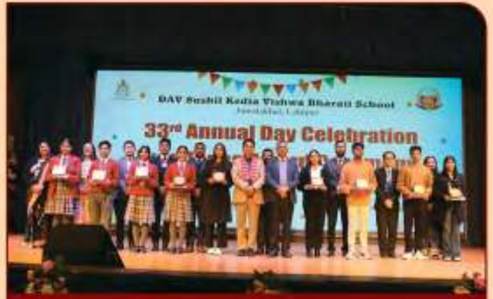
Ekalavya Award - Grade XI and XII