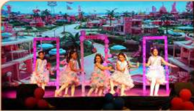
Students showcasing their talents during the Family Jamboree of Grade I and II.