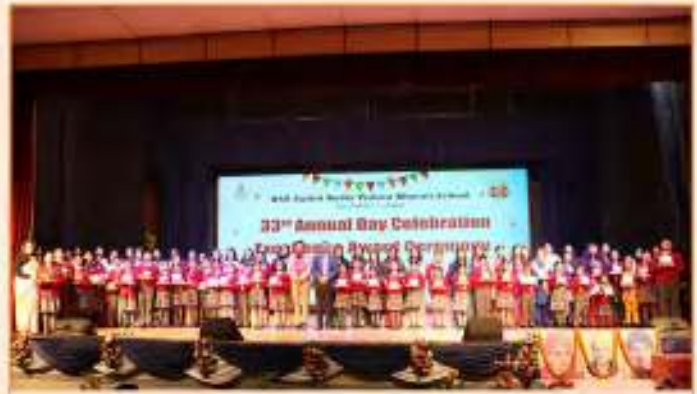
Ekalavya Award - Nursery to Grade IV