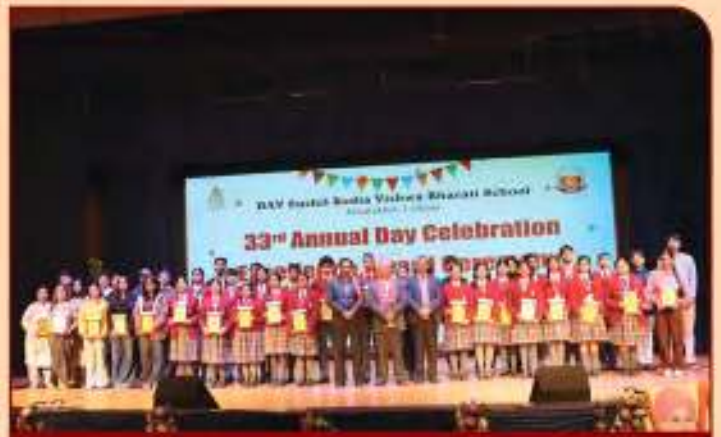
Academic Excellence Award - Grade IX to XII