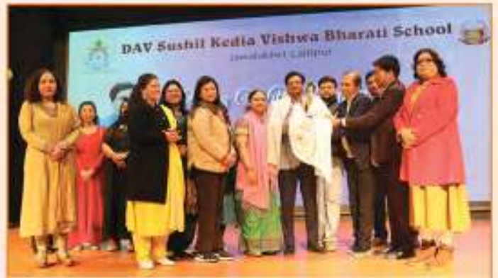
The School Administration Team and Teachers posing for a group photograph with the Chairperson and the First Lady during Chips with Chairman Programme.