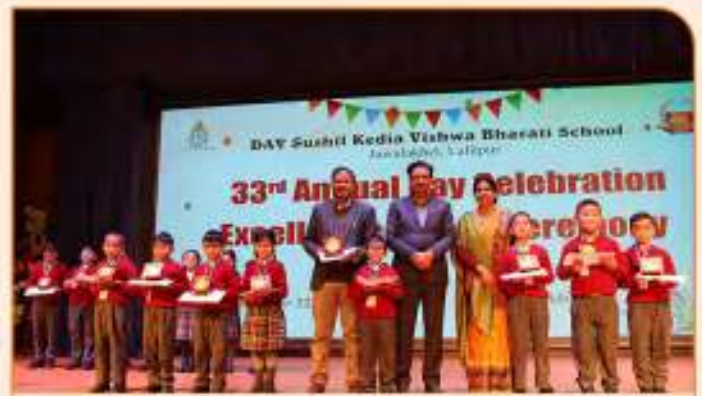
Chairman Gold Star Award - UKG