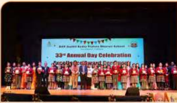
Ekalavya Award - Grade V and VI