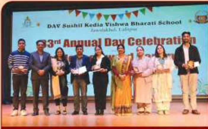
Chairman Gold Star Award- Grade XII