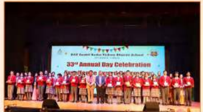
Ekalavya Award - Grade VII and VIII