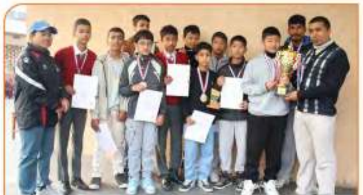
The DAV Under-13 Football Team proudly secured the runner-up position at the 4 th NIST Cup Football Tournament held in February, 2026. The tournament, conducted in a league-cum-knockout format, featured participation from nine schools across Kathmandu Valley.