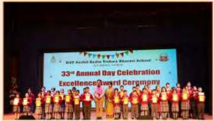
Best Portfolio Award -Nursery to Grade IV