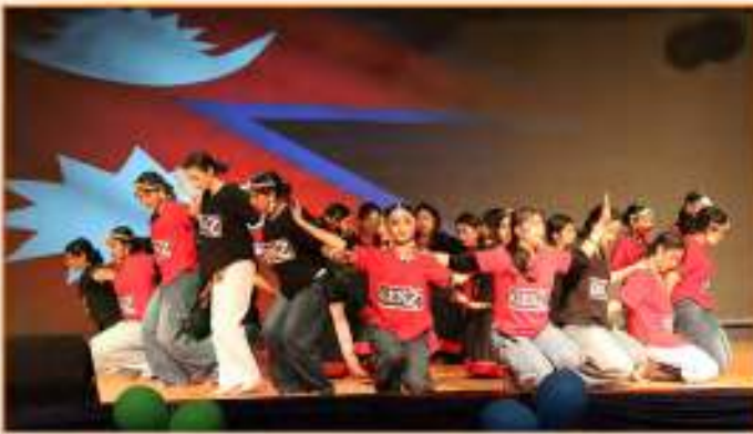
Grade IX students presenting the contemporary Gen Z movement of Nepal through thematic dance and enactments at their Family Jamboree.