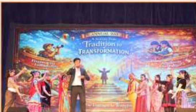
From Tradition to Transformation: A cultural performance at the 33 rd Annual Day and Excellence Award Ceremony.