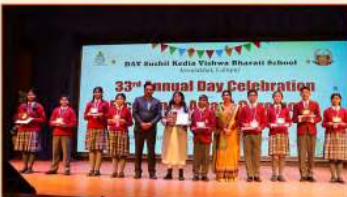
Chairman Gold Star Award -Grade VII