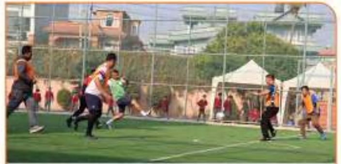
The Parental Involvement Team, in collaboration with DAV Sports Academy, organised the third edition of Sporty Parent – Sporty Kid, a motivational and recreational programme aimed at inspiring children through active parental participation, at the School premises.