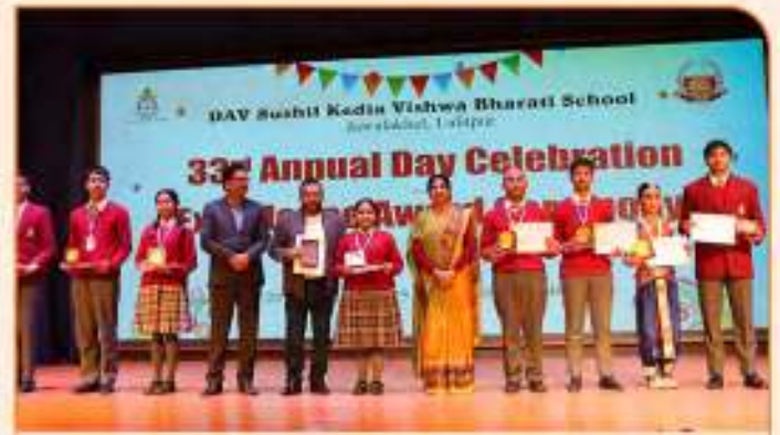
Chairman Gold Star Award -Grade IX