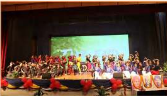
A group of students presenting a cultural dance during the Family Jamboree of Grade VII.