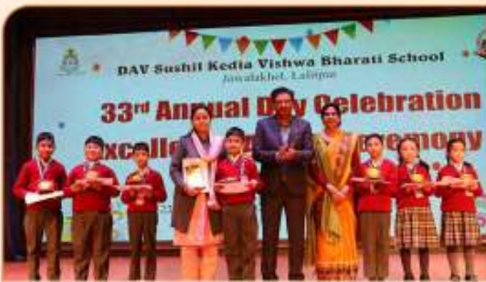
Chairman Gold Star Award - Grade I