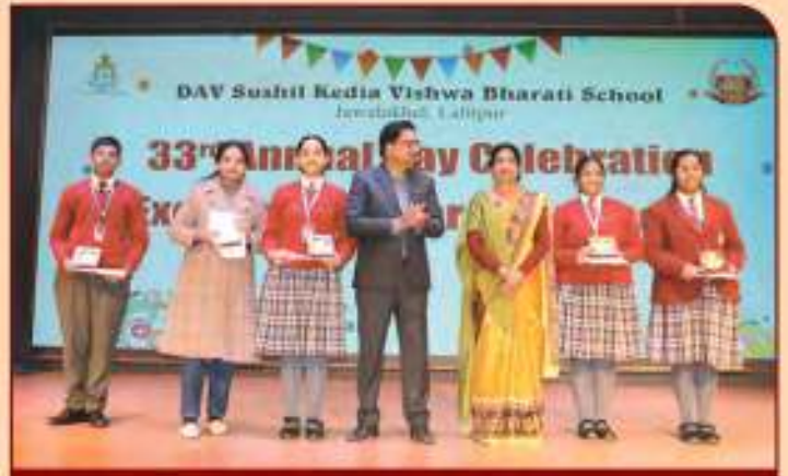
Chairman Gold Star Award - Grade XI