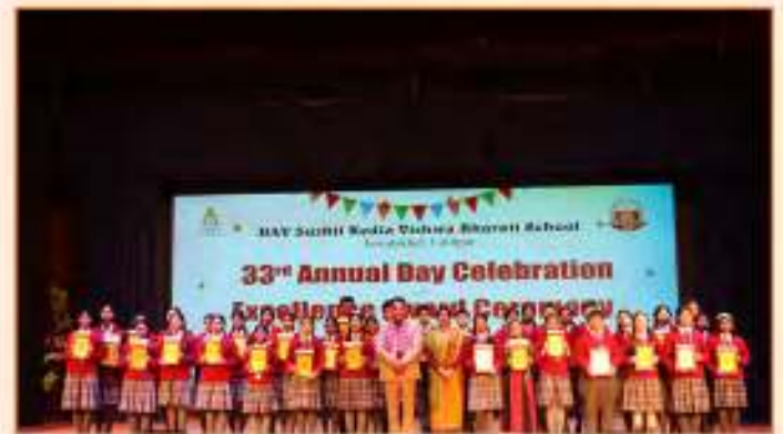
Best Portfolio Award- Grade V to VIII