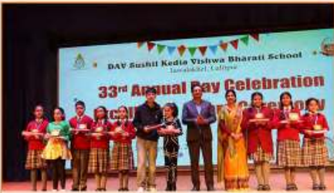
Chairman Gold Star Award - Grade IV