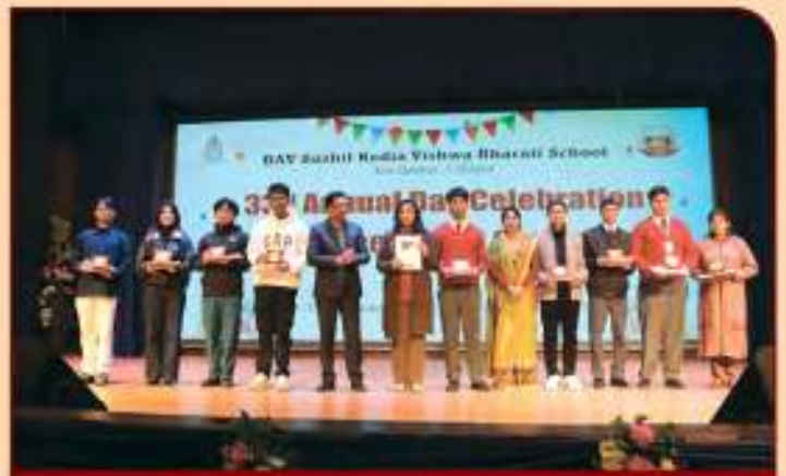
Chairman Gold Star Award - Grade X