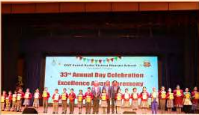
Academic Excellence Award - Nursery to Grade IV