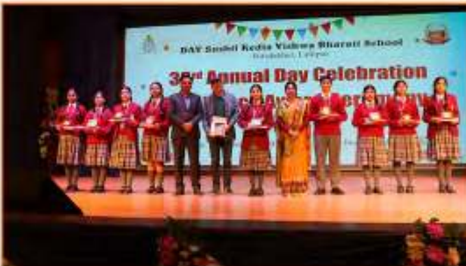
Chairman Gold Star Award -Grade VIII