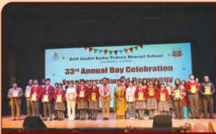
Best Portfolio Award - Grade IX to XIII