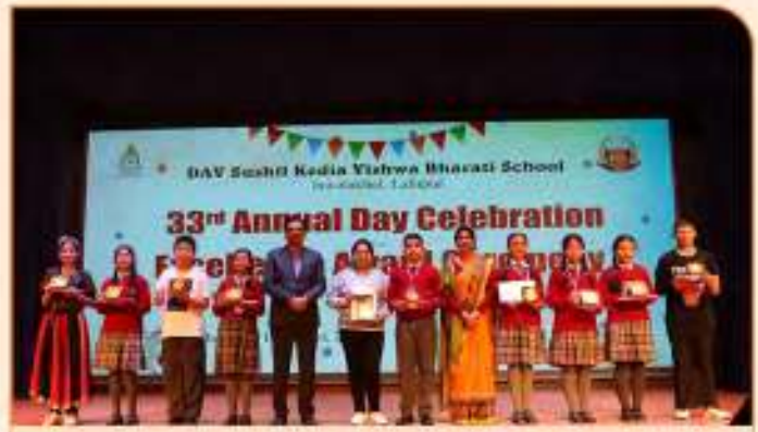
Chairman Gold Star Award - Grade V