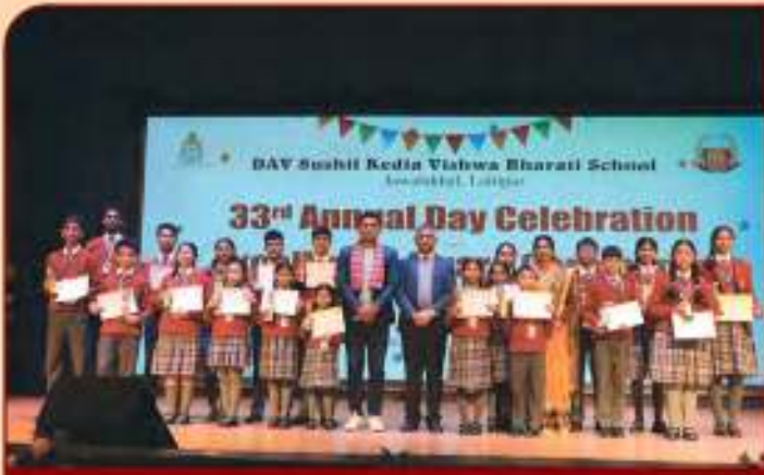
Sports Star Award- Grade III to XII