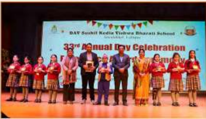
Chairman Gold Star Award - Grade III