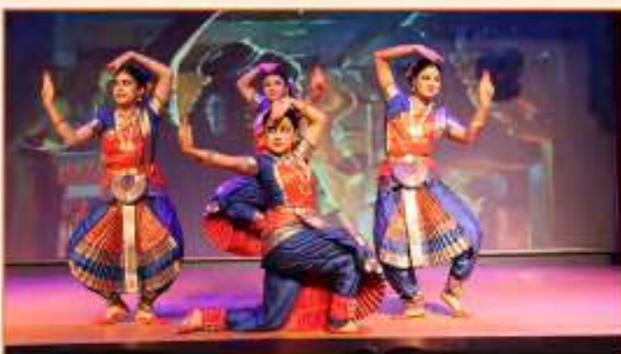
Students performing Bharatanatyam at the closing ceremony of 202 nd Birth Anniversary of Swami Dayananda Saraswati.