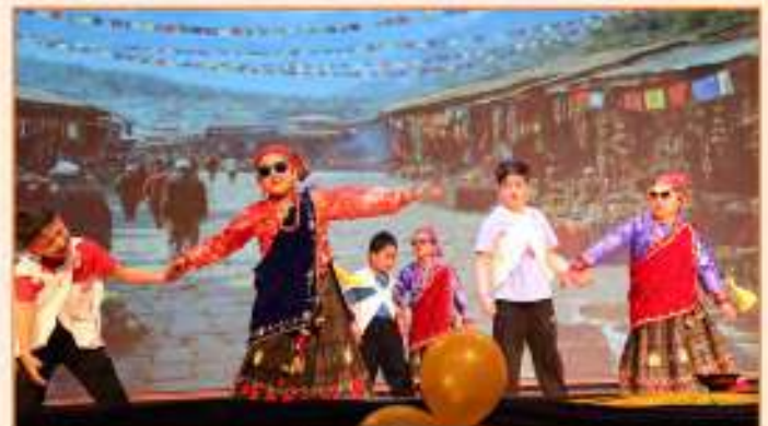
Kindergarten students shining with their performances during the Family Jamboree and Graduation Ceremony of UKG.