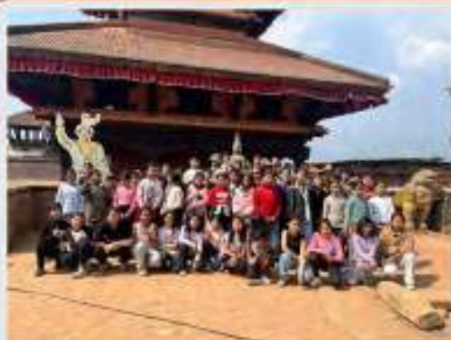
The students of Grade IV enjoyed a memorable educational tour to Historical Nuwakot Durbar in Nuwakot during the last week of February as part of school's annual educational tour programme.