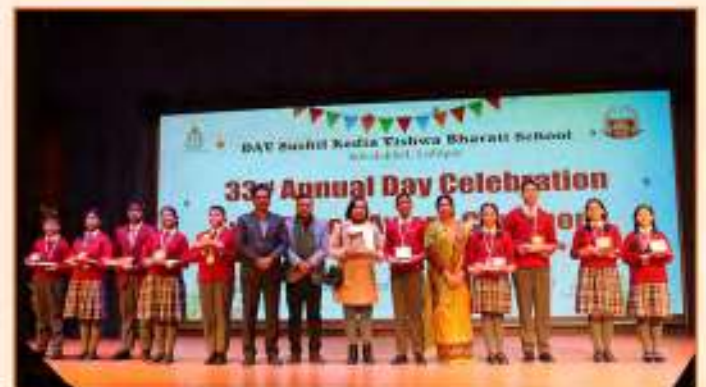
Chairman Gold Star Award - Grade VI