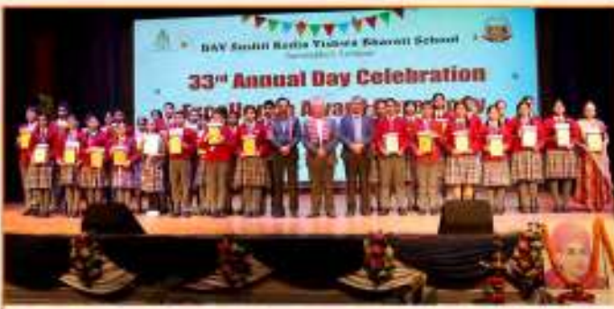
Academic Excellence Award - Grade V to VIII