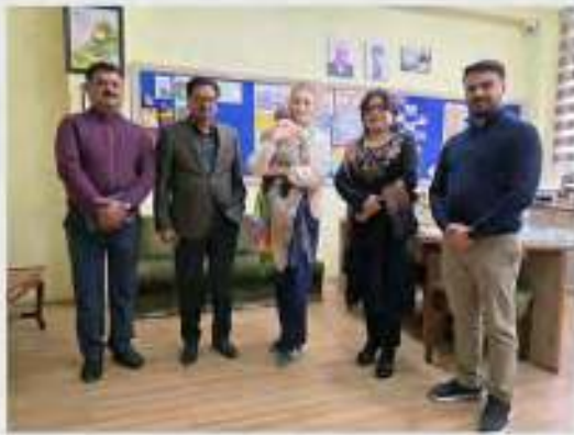
Representatives of Goethe Institute Max Muller Bhavan New Delhi, India and DAV School's Authorities posing for a group photograph during co-operation agreement at the Principal's Office on February 24 th . The co-operation agreement was a part of the 'School's Partners of the Future (PASCH) Initiative'.