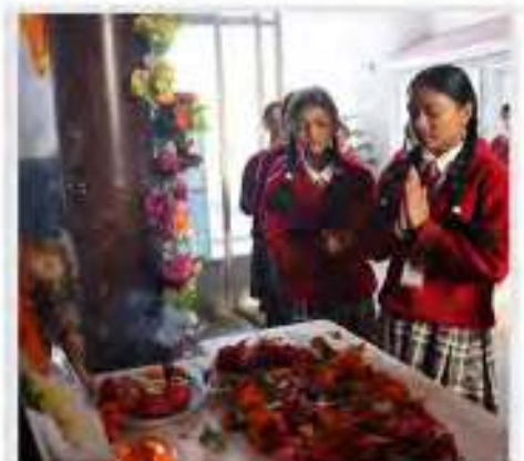
A floral homage and prashad distribution ceremony was observed at Shankar Sadan and Indu Sadan on 11 th February, 2026 to mark the 202 nd birth anniversary of Swami Dayananda Saraswati.