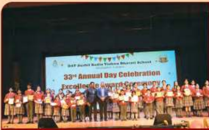
Read to the Principal Award- Grade I to XI