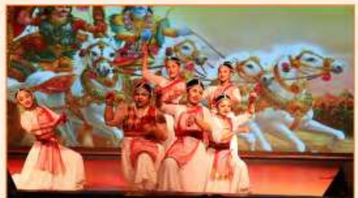
Students presenting classical dance at the closing ceremony of 202 nd Birth Anniversary of Swami Dayananda Saraswati.