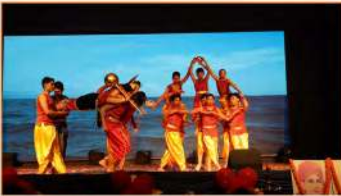
Grade VIII students beautifully depicting stories from the Ramayana during their Family Jamboree.