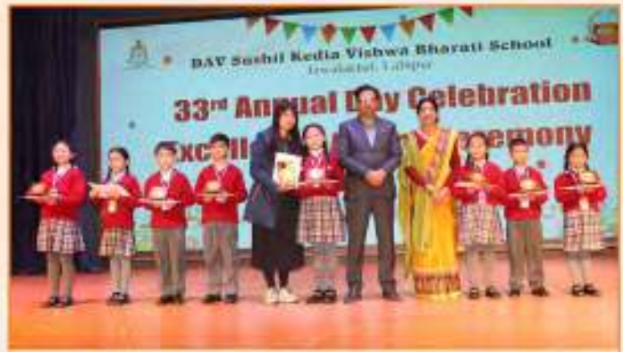
Chairman Gold Star Award - Grade II