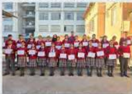
Grade VI 486, Grade VII 517 and Grade VIII 186 stickers.