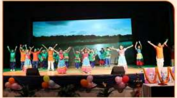
Grade III students showcasing their creativity and talents to their parents during the Family Jamboree.