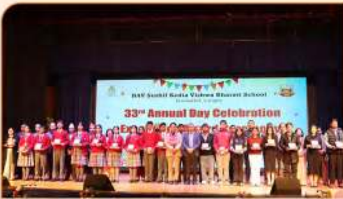
Ekalavya Award - Grade IX and X