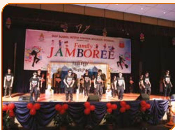
Hookstep Mashup Dance