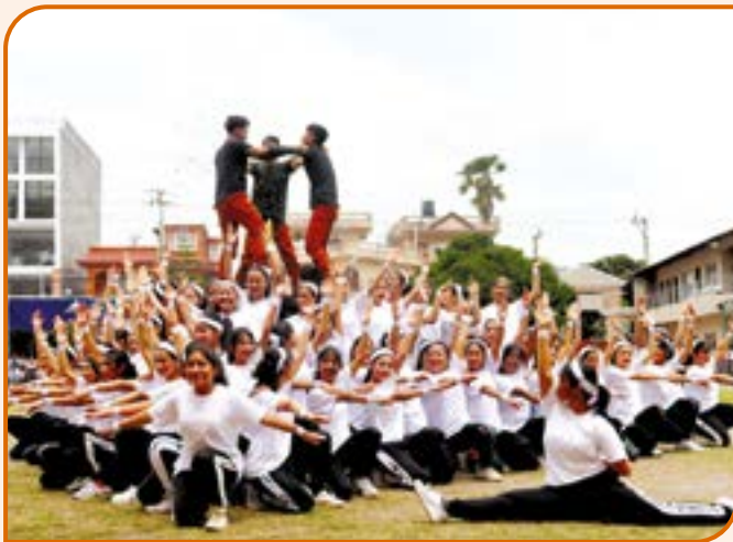
Cultural Programme of Investiture Ceremony