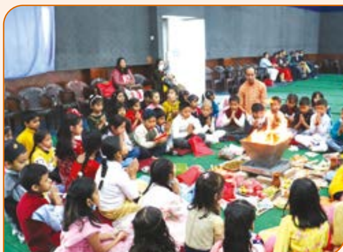
Panchakundiya Vidya Subharambha Havan