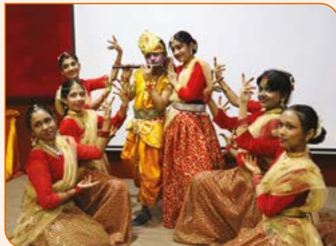
Krishna Janmashtami in Middle School