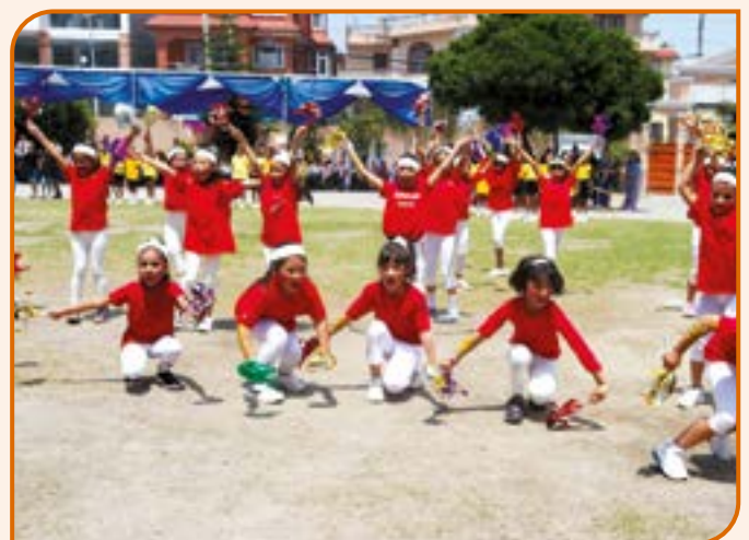
Students performing Zumba dance skills in Investiture Ceremony