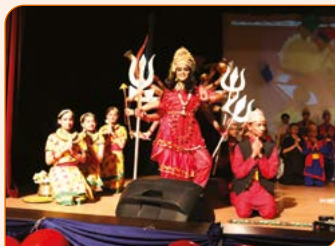
Students Performing Thematic Nawaratra Dance