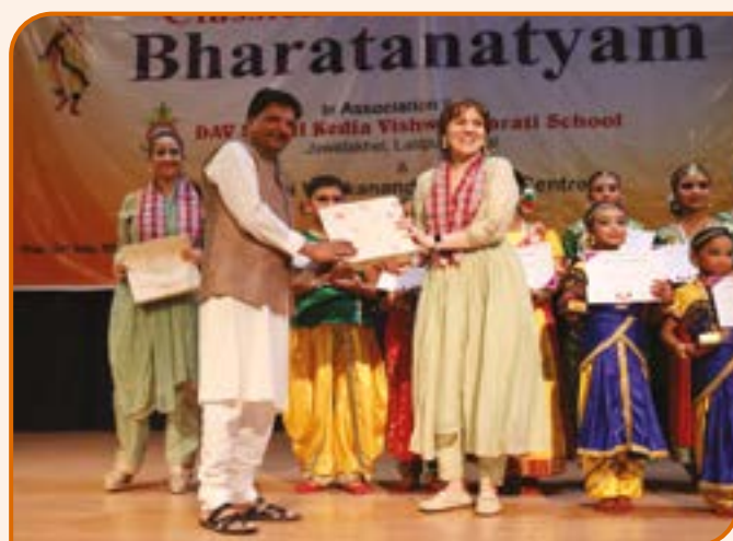
DAV Chairperson honouring the guests and winners during Bharatnatyam Classical Dance Evening