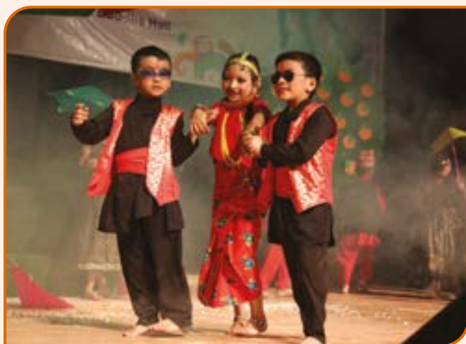
Nepali Dance of Grade II Jamboree