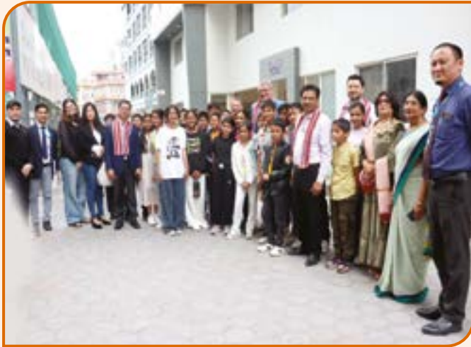
Celebration of German Day