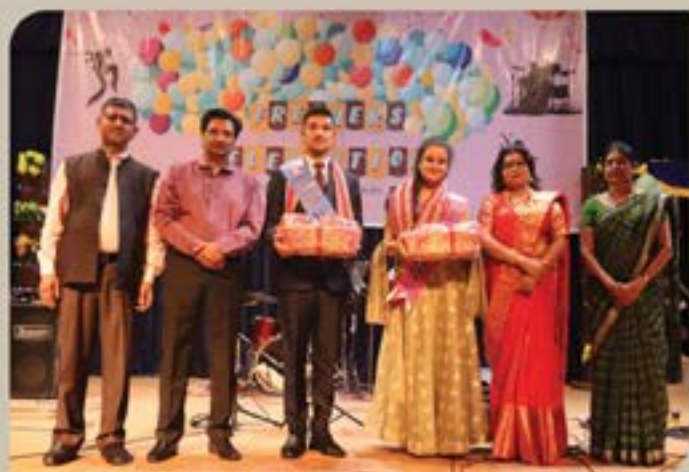
Welcome programme of Grade XI