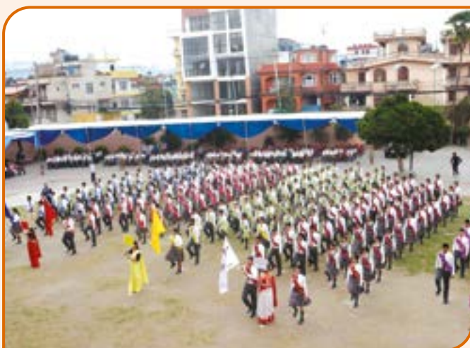
Oath Taking Ceremony of Senior School Investiture Ceremony