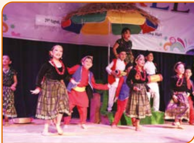
Grade II students performing their talents in Jamboree