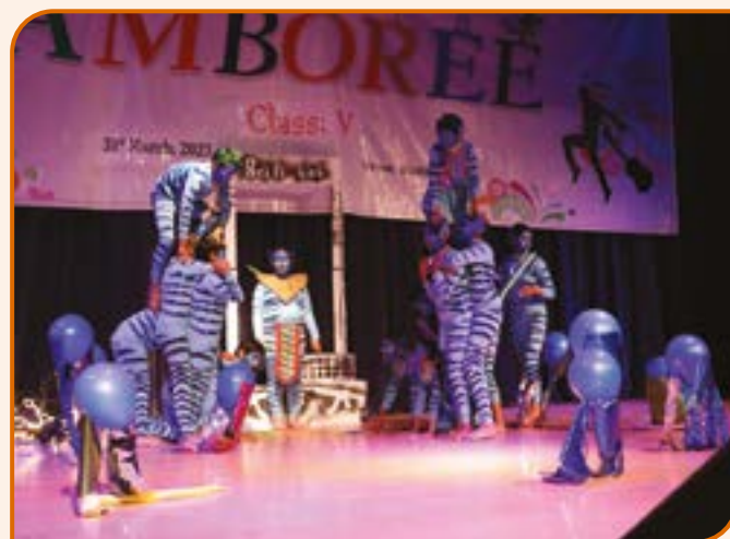
Grade V students demonstrating their outstanding talents and skills