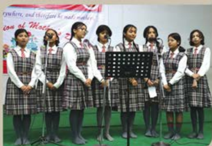
Students performing mother's song in "Matatirtha Aushi"