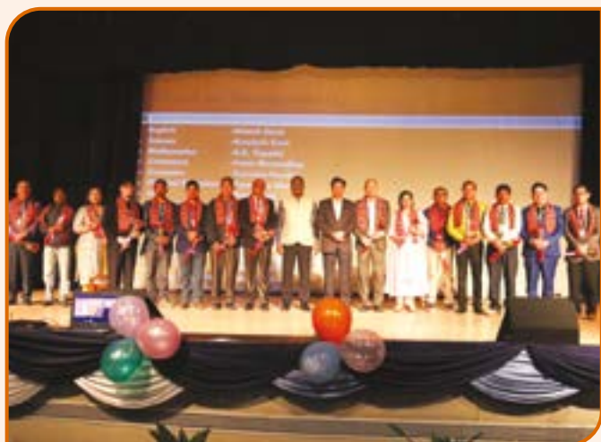
HoDs posing for a group photograph with Chairperson and his guest