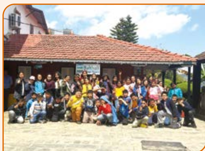
Students at Balthali Village Resort, Panauti Kavre