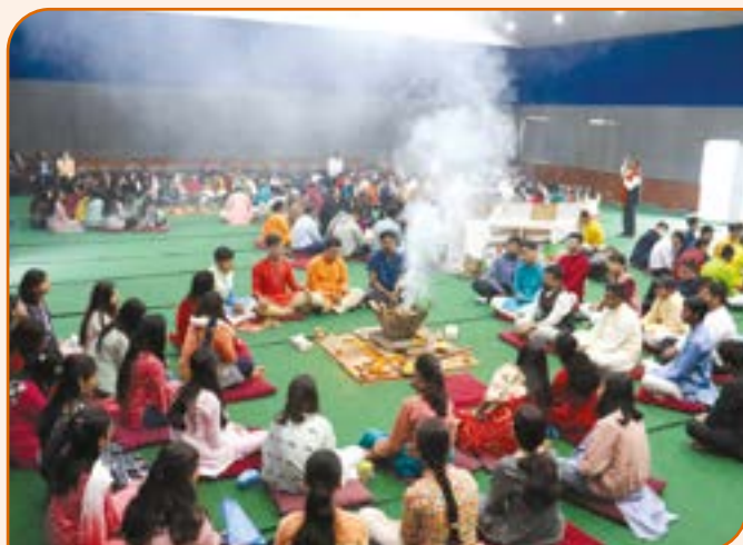
Panchakundiya Vidya Subharambha Havan