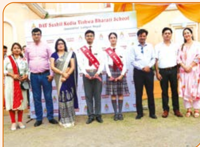
School Headboy and Headgirl with their parents and school heads