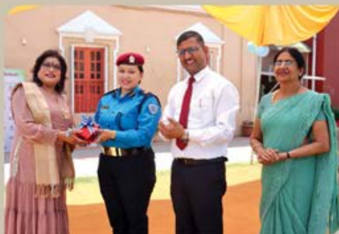
Inspector of Sanepa Police Office receiving a token of love in investiture ceremony