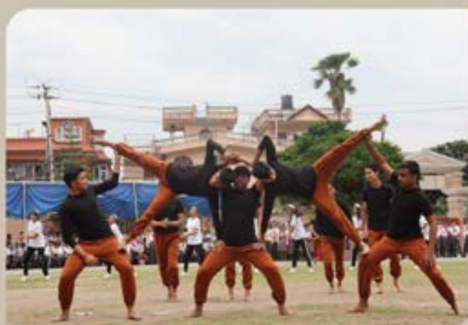
Students performing their talents in investiture ceremony