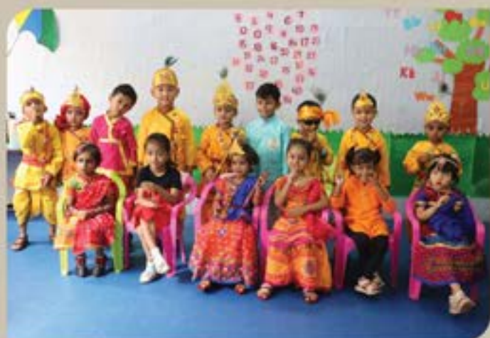
Celebration of Krishna Janmastami at Kindergarten School