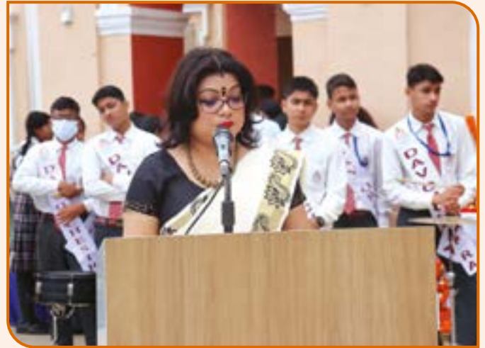
Principal Administering Oath Taking Ceremony