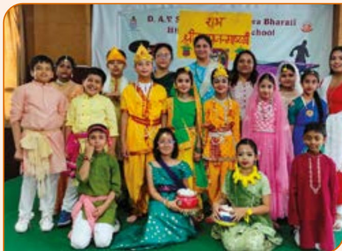
Students of Junior School Celebrating Krishna Janmashtami