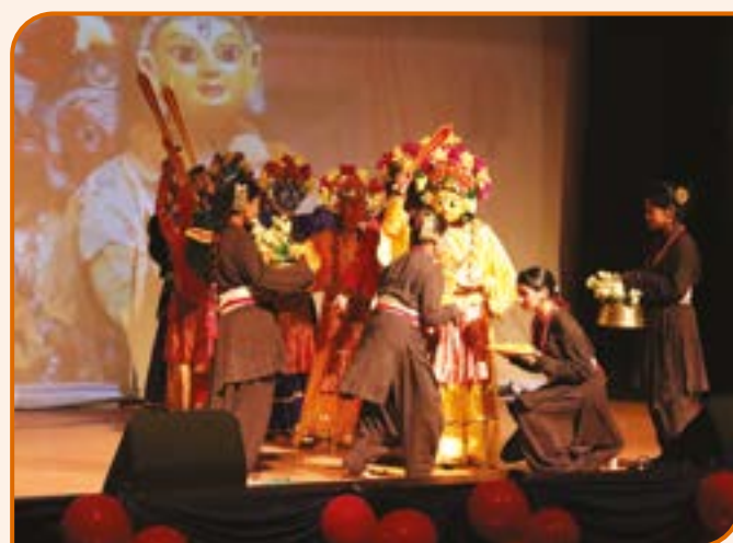
A Thematic Navaratra Dance