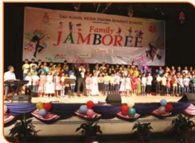
Grade II students presenting their melodious song in Jamboree