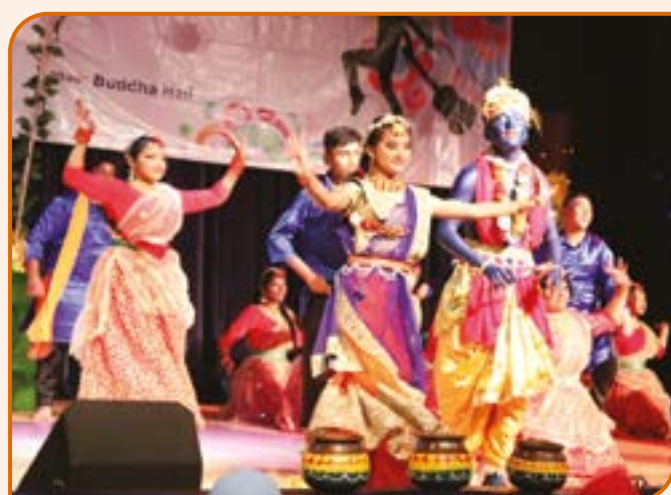
Family Jamboree of Grade VII