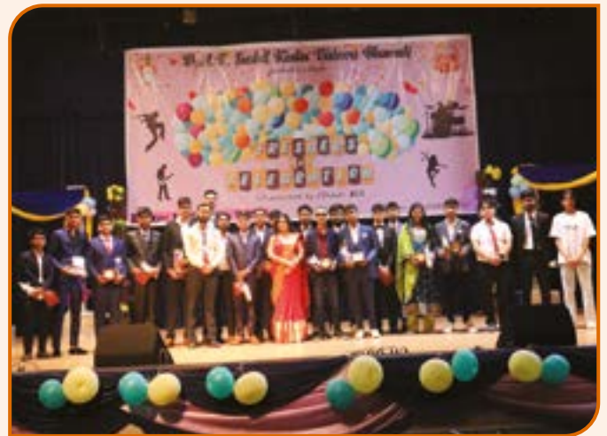
Welcome Programme of +2