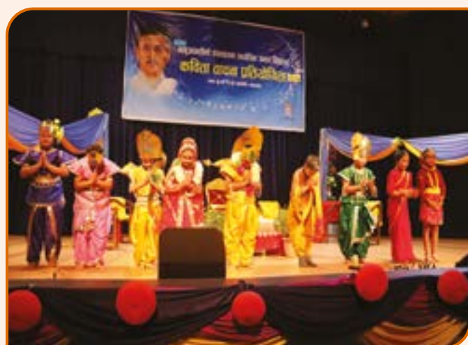
Celebration of Bhanujayanti