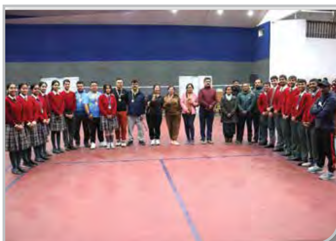
Event: Sporty Parent- Sporty Kid, 2023 (Badminton Competition Achievers)