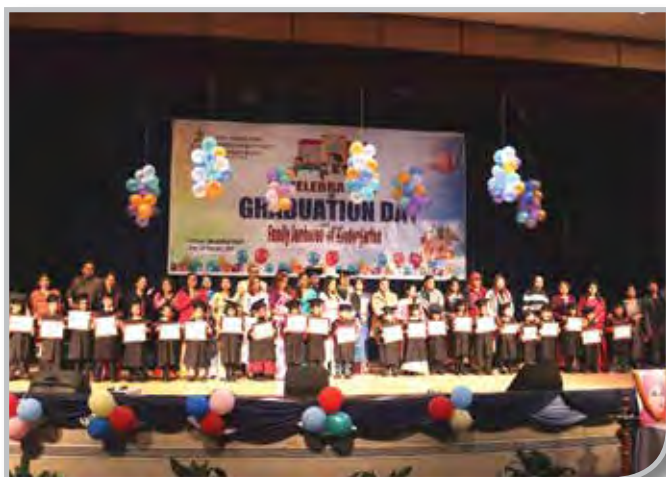
Event: Family Jamboree cum Graduation Ceremony of DAV Kindergarten Achievers: UKG 'A' Students