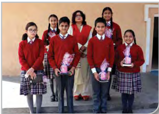
Event: Academic Award Distribution Ceremony Achievers: Grade VII Students