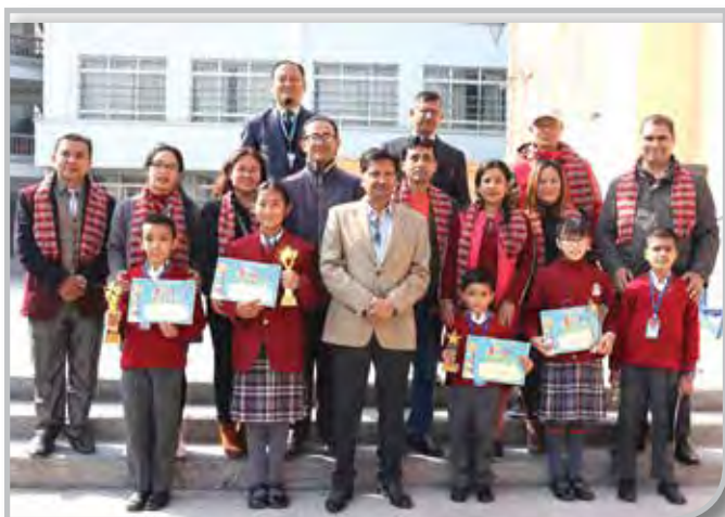
Event: 'STAR Student Award' Achievers: Grade I to V