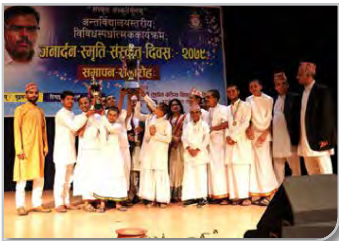
Celebration of 5th Janardan Smriti Sanskrit Diwas Achiever: Mahesh Sanskrit Gurukulam, Devghat, Tanahun