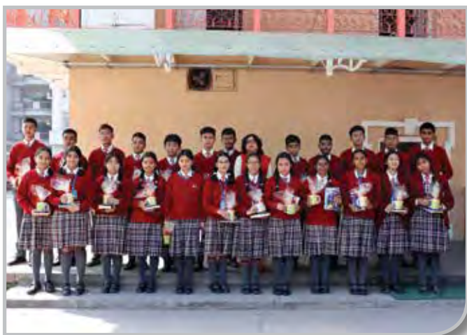
Event: Academic Award Distribution Ceremony Achievers: Grade X SEE