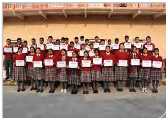
Event: 27th International NELTA Conference Achievers: Students were honoured with Certificate of Appreciation