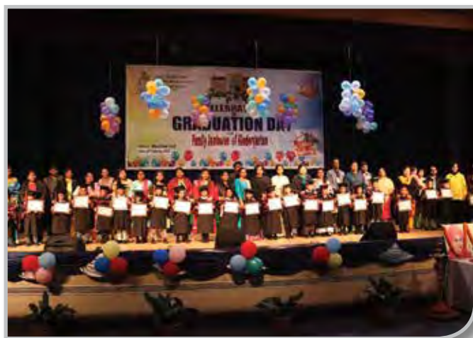
Event: Family Jamboree cum Graduation Ceremony of DAV Kindergarten Achievers: UKG 'B' Students