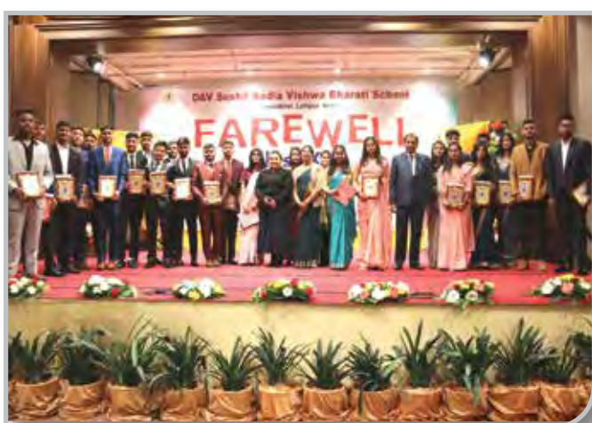
Event: Farewell of Grade XII Achievers: Grade XII 'C' Students