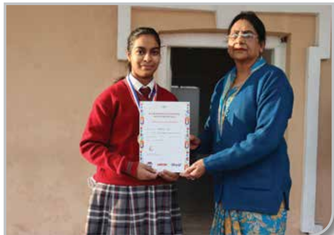
Level 1 'Kathmandu Interschool Pidilite Art Olympiad'