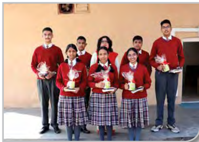
Event: Academic Award Distribution Ceremony Achievers: Grade X CBSE