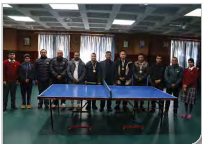
Event: Sporty Parent- Sporty Kid, 2023 (Table Tennis Competition Achievers)