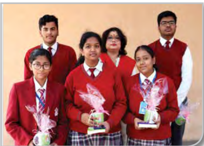
Event: Academic Award Distribution Ceremony Achievers: Grade XII (Science)