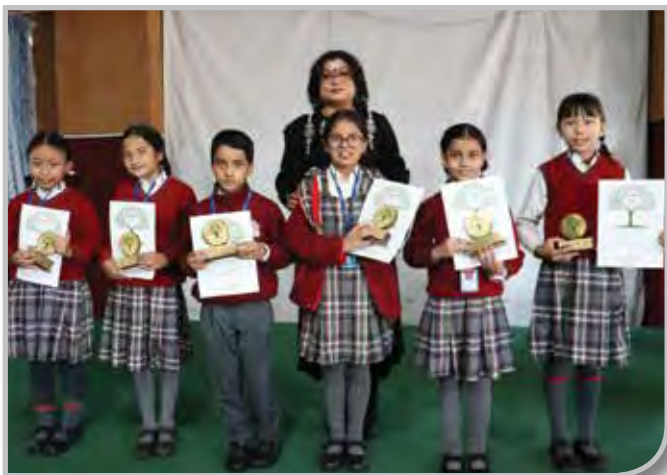
Character Tree Award Distribution Ceremony for Grade I to IV Students