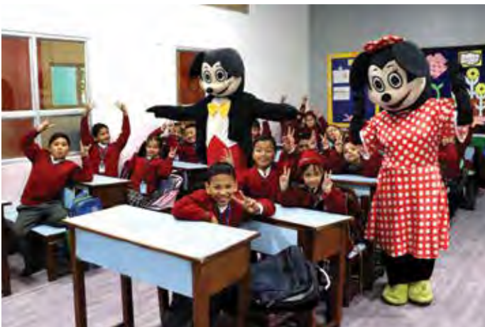
Amusing view of Grade II 'A' observed at the School on January 17. The School resumed after a 3-week winter break on January 17, 2023.