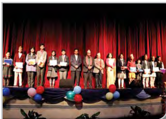
Event: DAV Devnagari Diwas, Inter School Competition Achievers: All the Winners of Inter School Competition