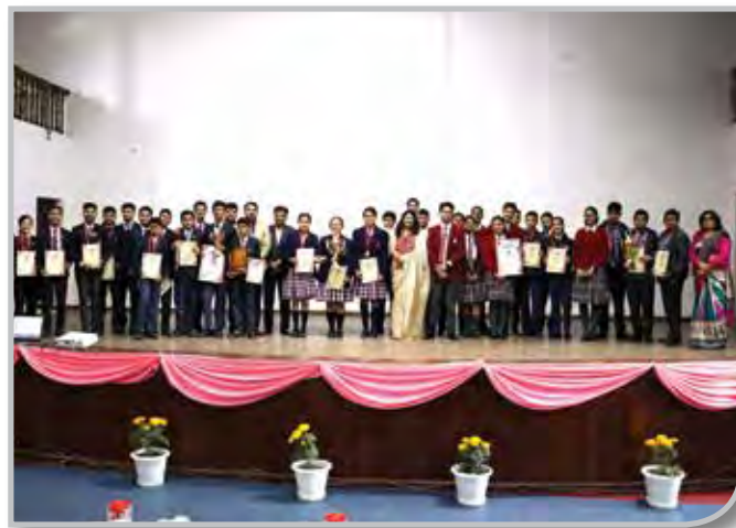
1st International Science Exhibition Event: Inter School Science Model Making Competition