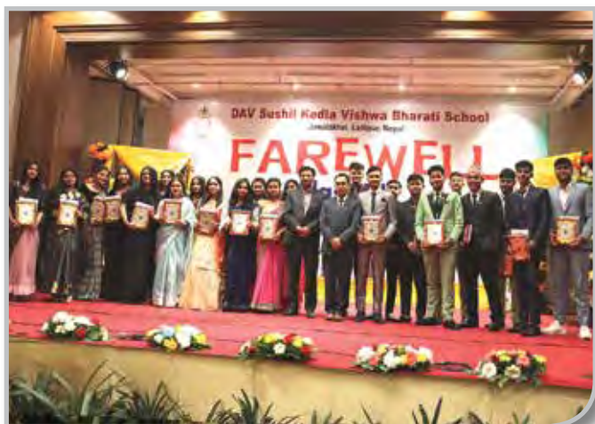
Event: Farewell of Grade XII Achievers: Grade XII 'E' Students