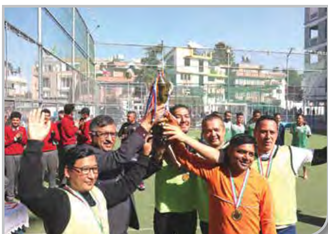
Event: Sporty Parent- Sporty Kid, 2023 (Futsal Competition Achievers)