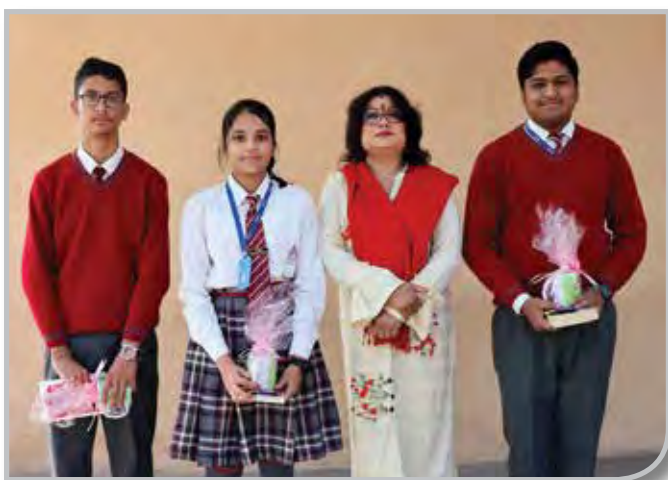
Event: Academic Award Distribution Ceremony Achievers: Grade XII (Commerce)