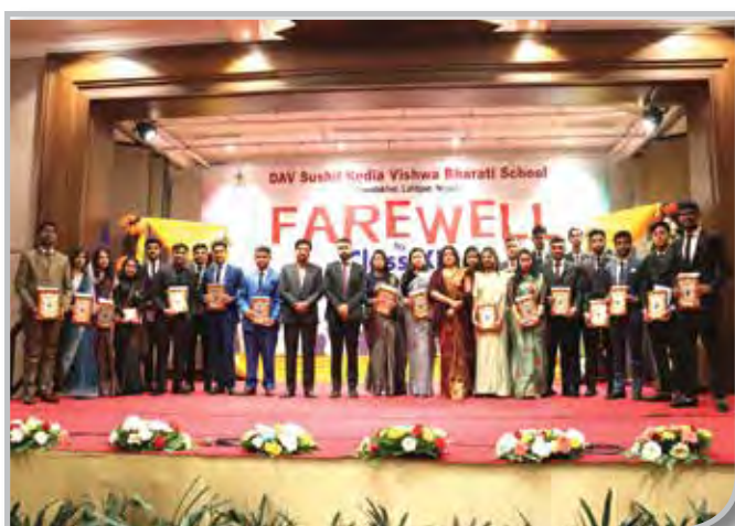
Event: Farewell of Grade XII Achievers: Grade XII 'A' Students