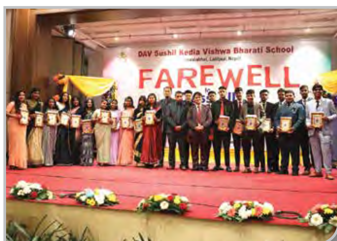
Event: Farewell of Grade XII Achievers: Grade XII 'D' Students