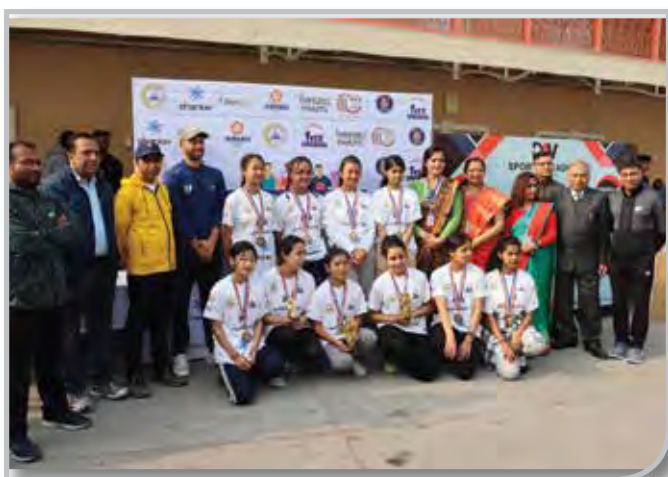
Event: Run for Education Achievers: Top 10 Finishers (Boys and Girls Categories)