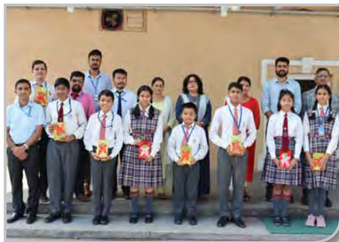
Event: Principal's Subject Sweepstakes of English Subject Achievers: Grade V to XII