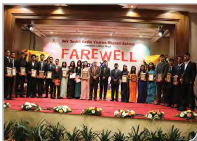
Event: Farewell of Grade XII Achievers: Grade XII 'B' Students