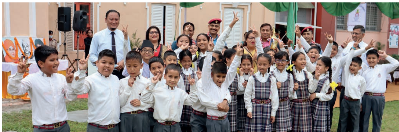
Police among the students, parents and teachers. Mt. Gaurishankar House grabbed the most awaited