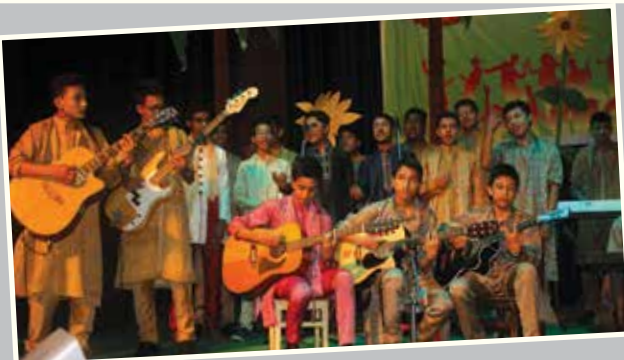
Grade X Students performing a song during the family Jamboree