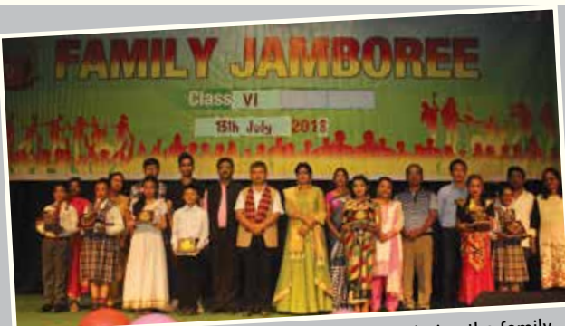
The winners of Ekalavya Award from Grade VI during the family Jamboree and annual excellence award distribution ceremony.