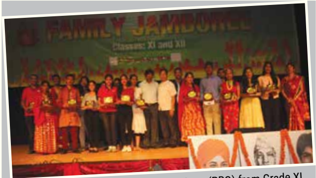
The winners of People Respecting Others (PRO) from Grade XI and XII during the family Jamboree and annual excellence award distribution ceremony.