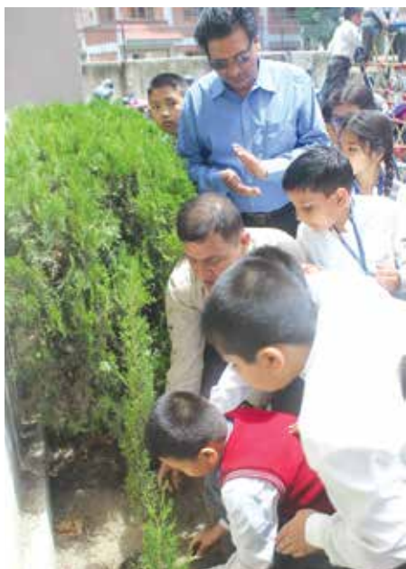
The primary-wing celebrated World Environment Day (WED) in their own way

on 5th June, 2018. Newton Science Club of primary-wing organised plantation programme for the representative students of all classes; prefect members and executive members of Newton Science Club to mark the celebration of world environment day.