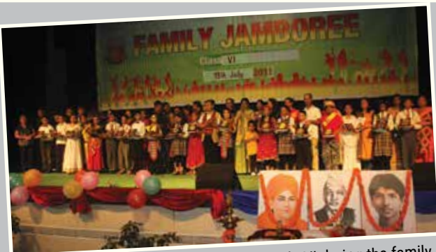
The winners of 100% Attendance from Grade VI during the family Jamboree and annual excellence award distribution ceremony.