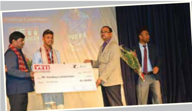
The directors Yeti Carpet felicitating Cricketer Mr. Sandeep Lamichhane.