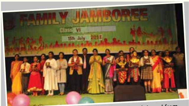
The winners of People Respecting Others (PRO) Award from Grade VI during the family Jamboree and annual excellence award distribution ceremony.