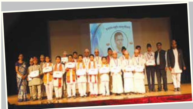
The winners of 1 st Late Janardan Ghimire Memorial Inter School Sanskrit Sholkas Recitation Competition