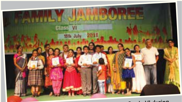
The winners of Character Tree Award from Grade VI during the family Jamboree and annual excellence award distribution ceremony.