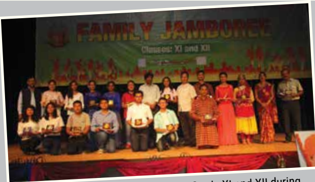
The winners of Ekalavya Award from Grade XI and XII during the family Jamboree and annual excellence award distribution ceremony.