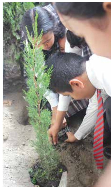
Plantation programme of secondary wing

DAVSKVB Kindergarten wing organised 3 different activities for Nursery, LKG and UKG students to mark the celebration of World Environment Day (WED) on 5 th June 2018. The students of Nursery participated in the activity called "tearing and pasting". LKG students took part in thumb printing activity. The theme for thumb printing activity is to save trees. UKG students made the dustbins and cleaned their playground. The objective of Environment Day celebration is to make students aware of the environment, according to Kindergarten activity in-charge Ms. Rupinder Kaur.