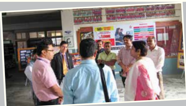
DAV Principal interacting with the representatives of DAV University Jalandhar, India