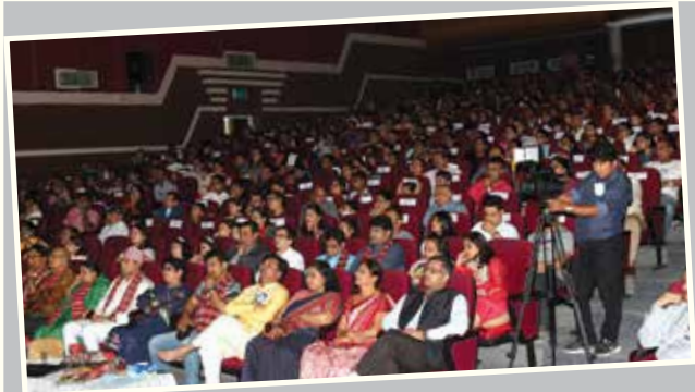
The audience of Hindi play 'Andha Yug'