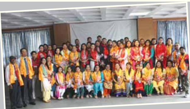
Teachers of Primary Wing posing for a group photo during Guru Purnima