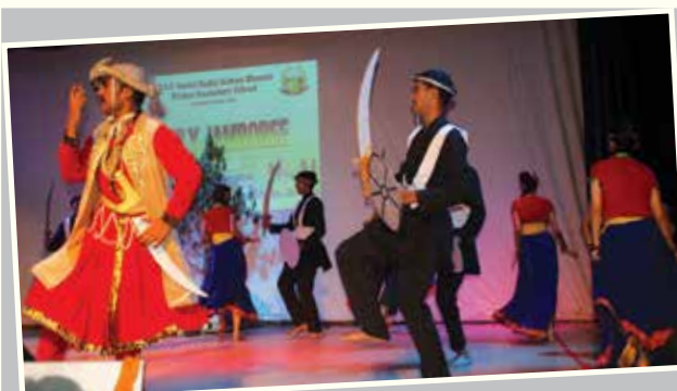
Grade XI and XII Students performing Hudkeli Dance during the family Jamboree