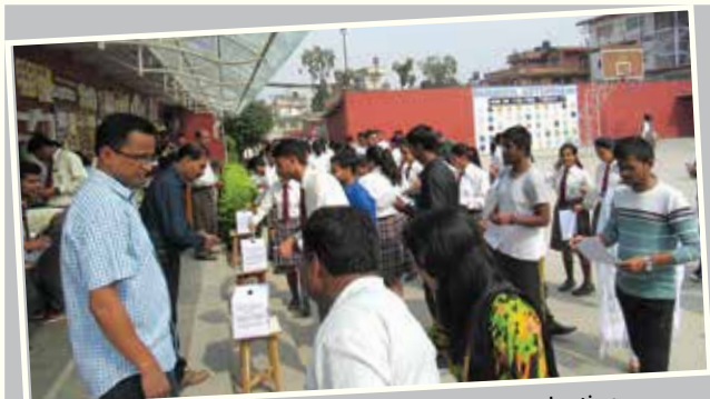
Students and Teachers participating in an election