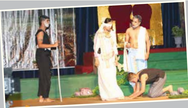
The students acting in the 'Andha Yug' Play