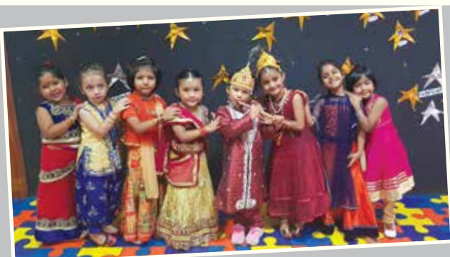
The tiny toddlers of Kindergarten wing posing for a group photo during Krishna Janmashtami