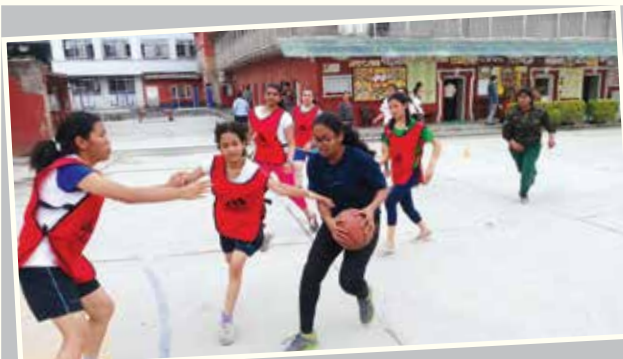
Basketball tournament of the girls