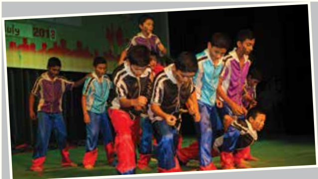
Grade VI Students performing a dance during the family Jamboree