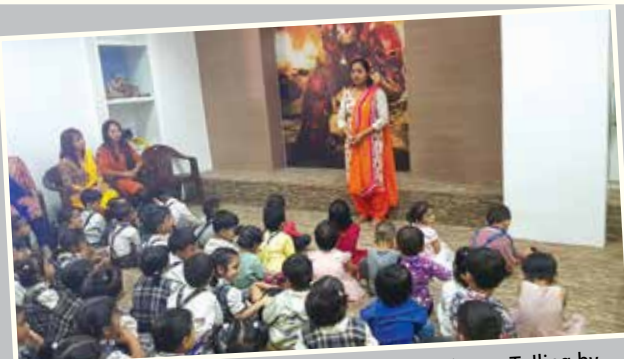
A mother narrating the story in a programme 'Story Telling by Parents' in Kindergarten Wing