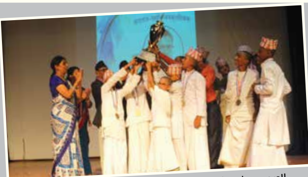
Mahesh Sanskrit Gurukulam, Devghat Tanahu, the overall champion of 1 st Late Janardan Ghimire Memorial Inter School Competition