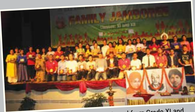
The winners of 100% Attendance Award from Grade XI and XII during the family Jamboree and annual excellence award distribution ceremony