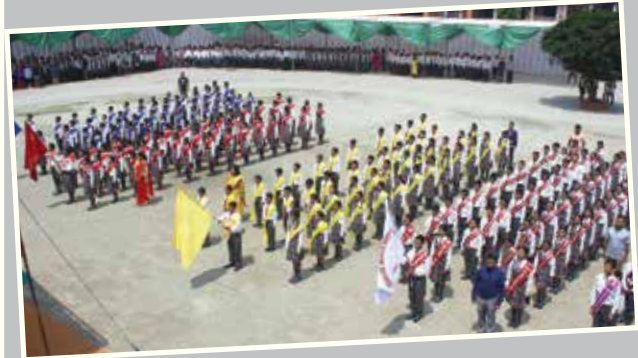
Students taking oath of office during the investiture ceremony