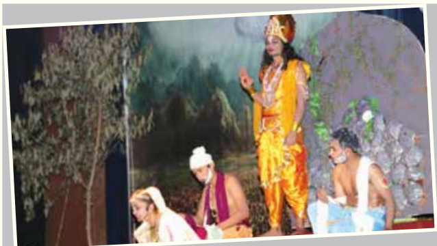
Students staging 'Andha Yug' Play