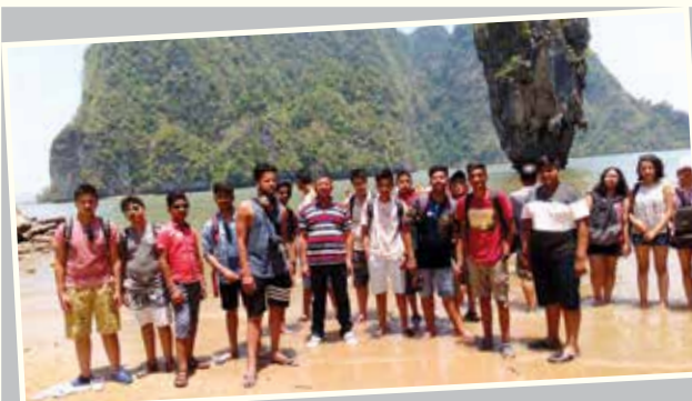
The team of DAVSKVB Students with Vice-principal and SSO posing for a group photo in Bangkok, Thailand.