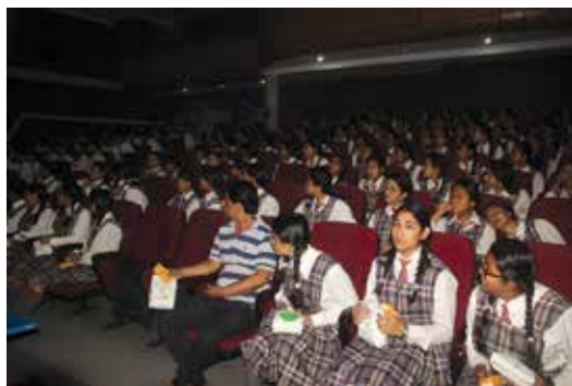
Jungle' for the fabulous fun day programme in Buddha Hall on 12 th June. The movie was released on 20 th December, 2017.

Similarly, Students of Grade IX and X were screened the movie 'Jumanji: Welcome to the