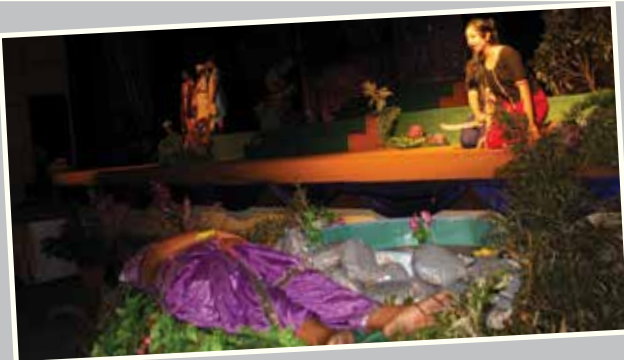
The Fall of Andha Yug Play