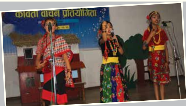
Students reciting a poem in inter school poem recitation competition