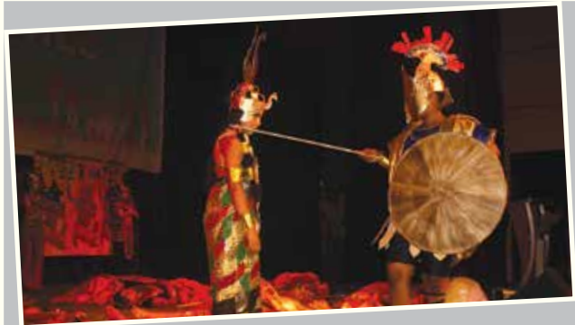
One of the striking scene of Family Jamboree of Grade VI