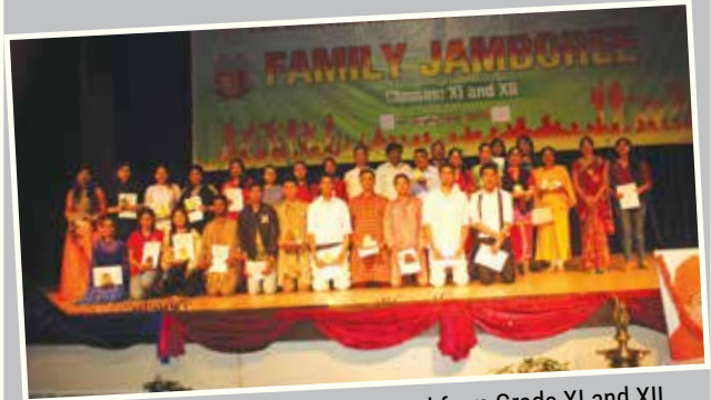
The winners of Character Tree Award from Grade XI and XII during the family Jamboree and annual excellence award distribution ceremony.