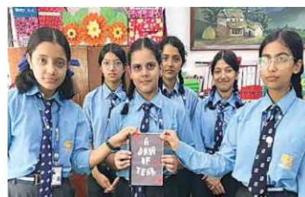
FEW GLIMPSES OF TEAMWORK PRESENTATION BY EACH GROUP OF CLASS 10 AND 8