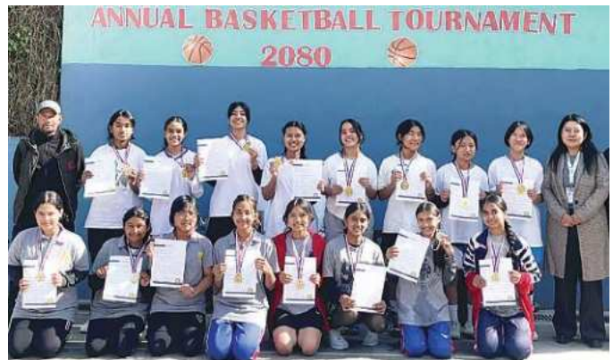
WINNERS OF ANNUAL BASKETBALL TOURNAMENT 2080 - CLASS 8