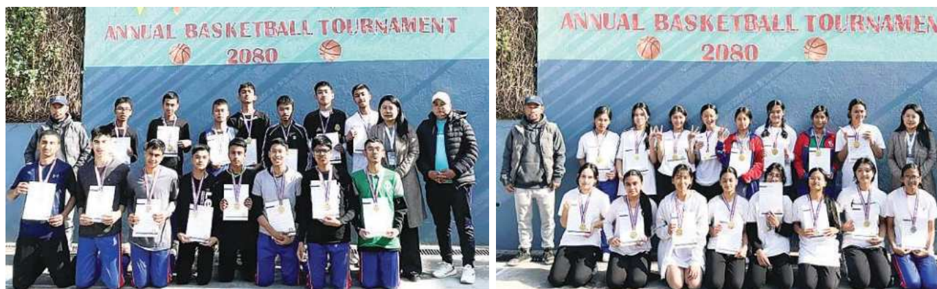
WINNERS OF ANNUAL BASKETBALL TOURNAMENT 2080 - CLASS 9