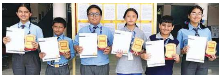
HANDWRITING COMPETITION WINNERS OF CLASS 7