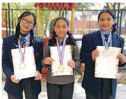
WINNERS OF AQUARIUM PAINTING