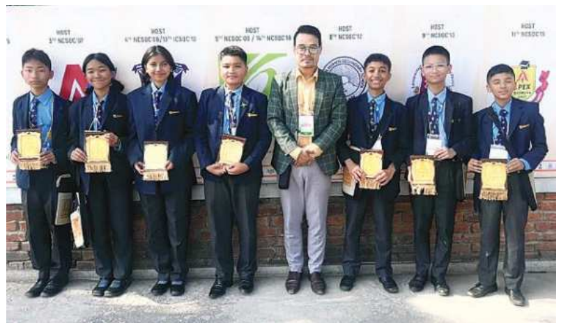
PARTICIPANTS OF 17TH NCSQC, SAURAHA, CHITWAN

17th NCSQC '23 is an annual national event which involved gathering of Students Quality Circles (SQC) students from various parts of Nepal. The convention was organized by QUEST-Nepal and hosted by Small Heaven Model School, Chitwan. The theme of this year's convention was SQC – A Pathway to learn 21st Century skills. The convention was held from 24 to 26 November 2023 in Sauraha, Chitwan at Seven Star Hotel. Altogether 500 students, teachers, educationists around Nepal gathered to this prestigious convention. Students participated in various competitive and non-competitive events; like Case Study Presentation, Panel Discussion, Workshops, Quality Quiz Contest, etc.