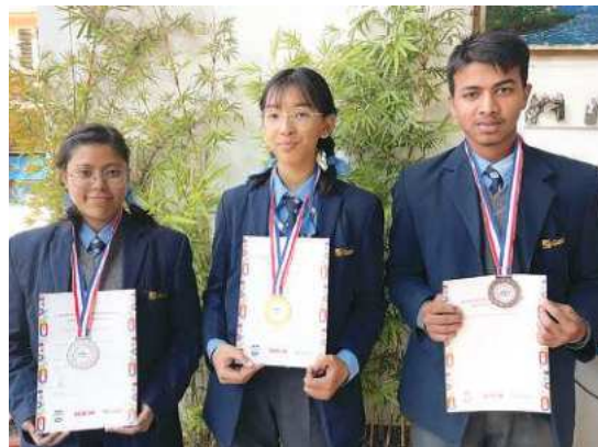
WINNERS OF GLASS PAINTING COMPETITION