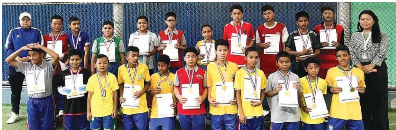
WINNERS OF CLASS 7 – BOYS TEAM