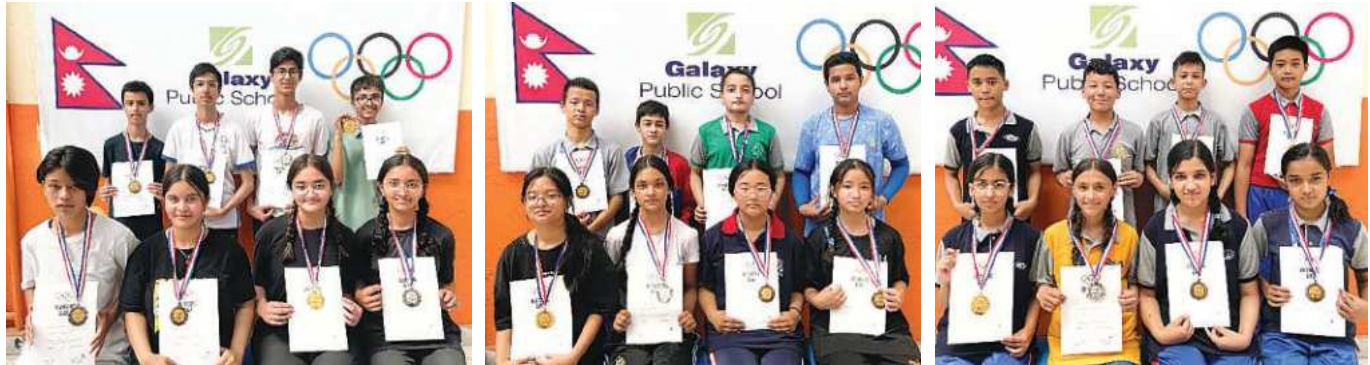
TT WINNERS OF CLASSES 10, 9 AND 8 RESPECTIVELY WITH THEIR MEDALS AND CERTIFICATES.