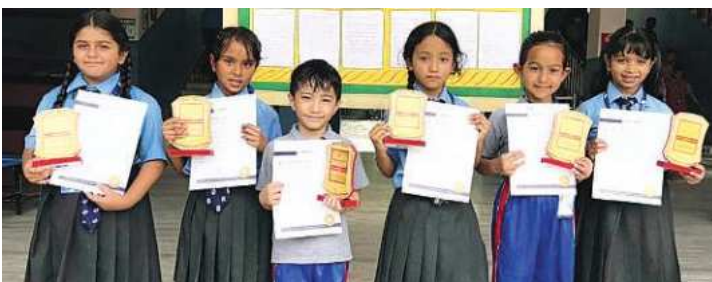
HANDWRITING COMPETITION WINNERS OF CLASS 2