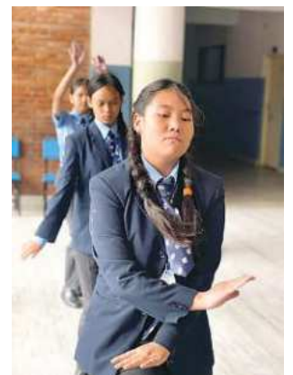
GLIMPSES OF DANCE EVALUATION