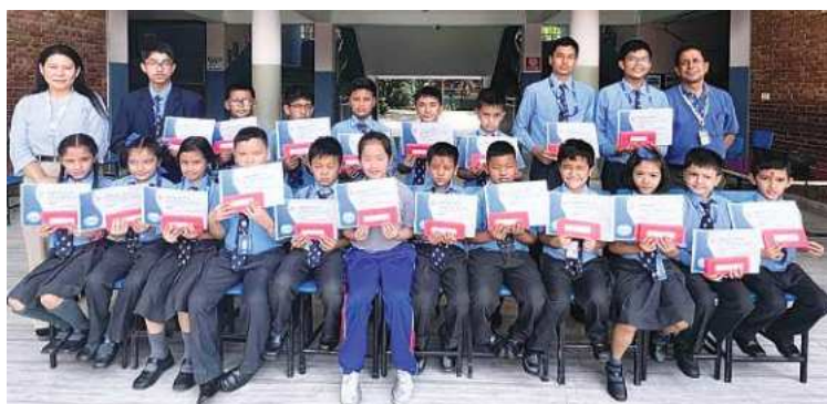
STUDENTS RECEIVING 80% AND ABOVE RECEIVED CERTIFICATES

TOFAS is a global assessment test that evaluates Fundamental Academic Skills, thereby providing educators with crucial insights as they address the learning needs of individual students. It is a Computer Based Test (CBT) for calculation, mathematics, programming and English vocabulary. It is a simple assessment focused on fundamentals, with a clear purpose of assessing the procedural fluency of examinees quickly and effectively. The name of the students receiving 80 % above are listed in the given table.