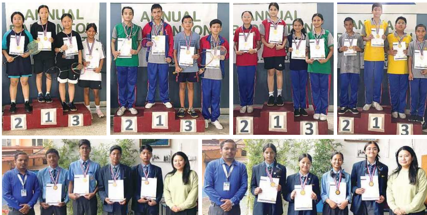
WINNERS OF BADMINTON TOURNAMENT 2080