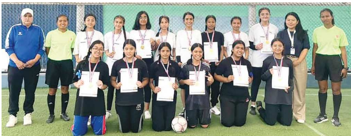
WINNERS OF CLASS 10 – GIRLS TEAM