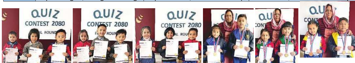
WINNERS OF QUIZ CONTEST - PRESCHOOL & CLASS 1