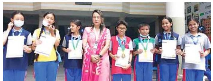
WINNERS OF PRODUCTIVE ART COMPETITION