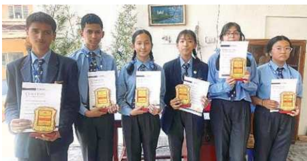
HANDWRITING COMPETITION WINNERS OF CLASS 9