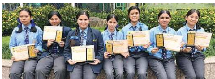
PARTICIPANTS OF THE CONVENTION - TEAM 3