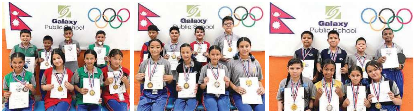
TT WINNERS OF CLASSES 7, 6 AND 5 RESPECTIVELY WITH THEIR MEDALS AND CERTIFICATES.