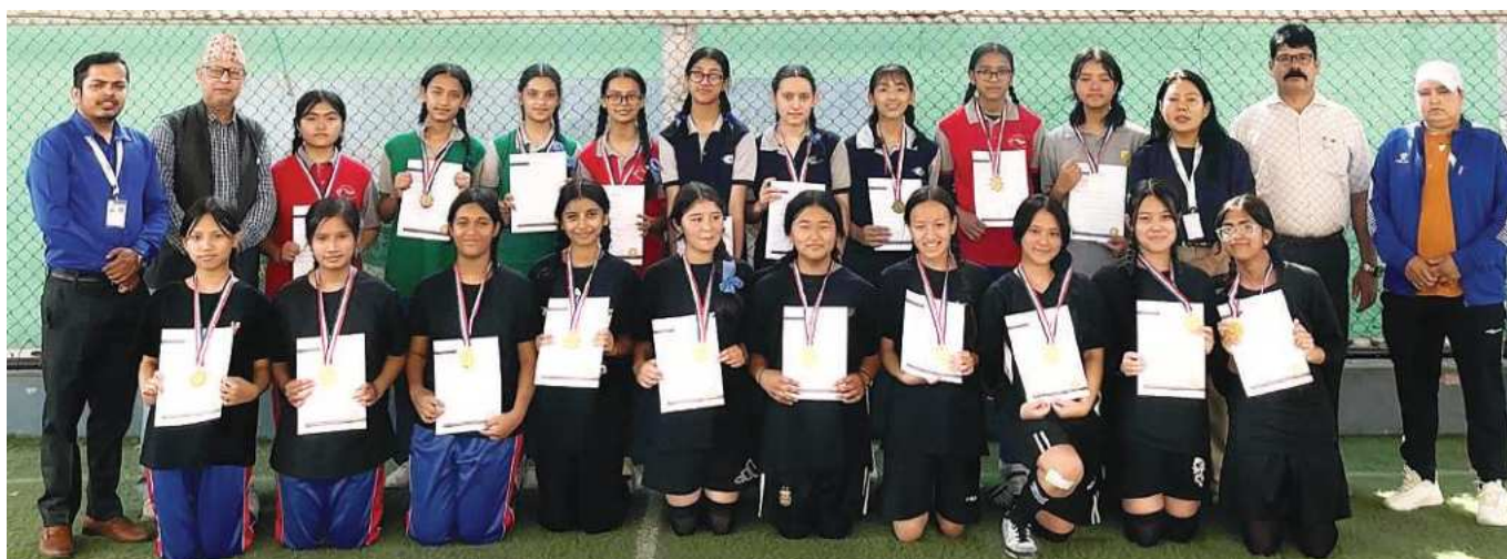
WINNERS OF CLASS 9 – GIRLS TEAM