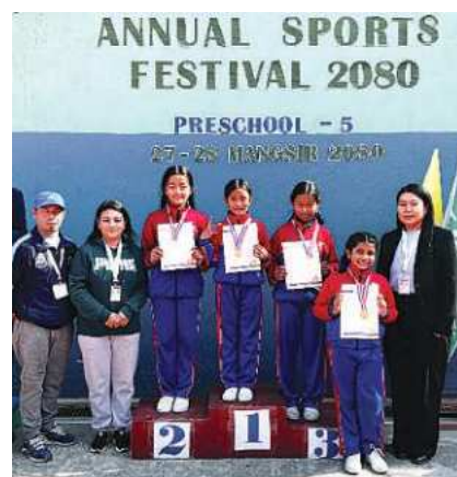
FEW GLIMPSES OF THE ANNUAL SPORTS FESTIVAL 2080 ( CLASS 4 - 5 )