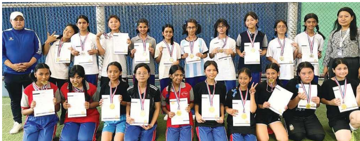
WINNERS OF CLASS 7 – GIRLS TEAM