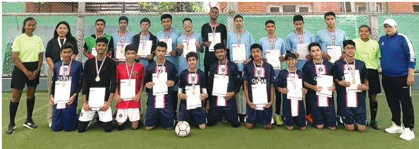
WINNERS OF CLASS 10 – BOYS TEAM