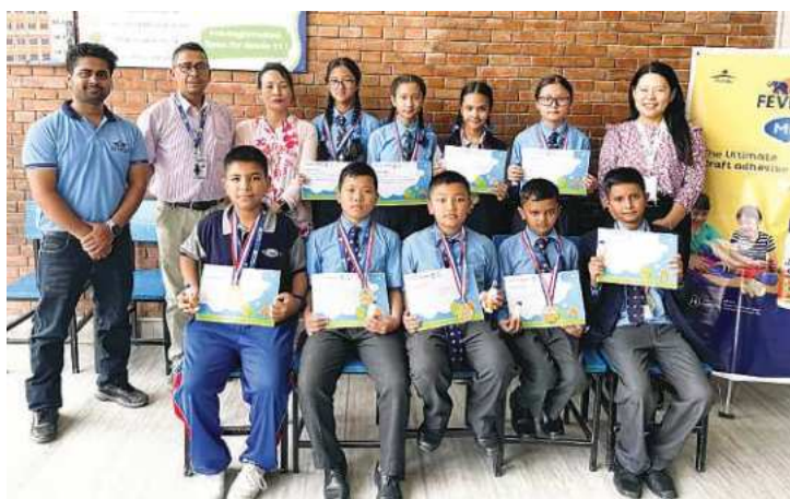
BEST RAKHEE MAKERS OF CATEGORY A & B