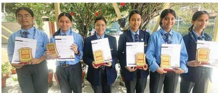
HANDWRITING COMPETITION WINNERS OF CLASS 10