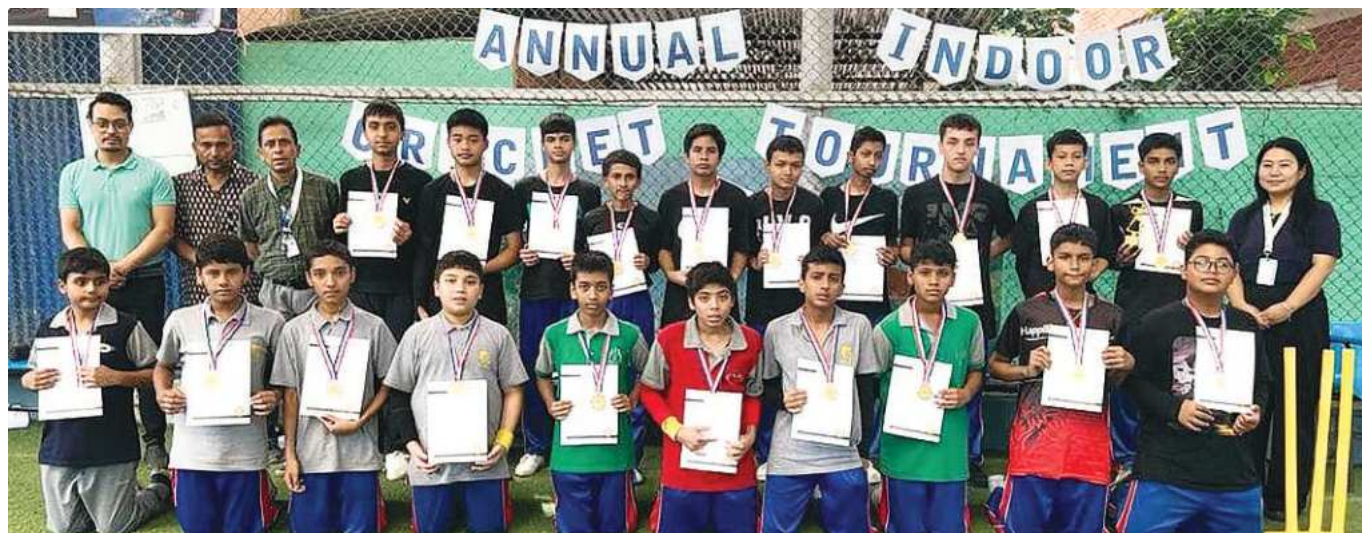
WINNERS OF INDOOR CRICKET TOURNAMENT 2080: MATCH BETWEEN CLASS 7 & 8 - BOYS