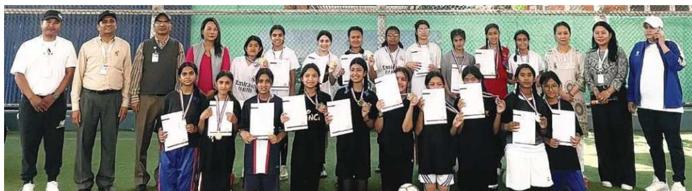
WINNERS OF CLASS 8 – GIRLS TEAM