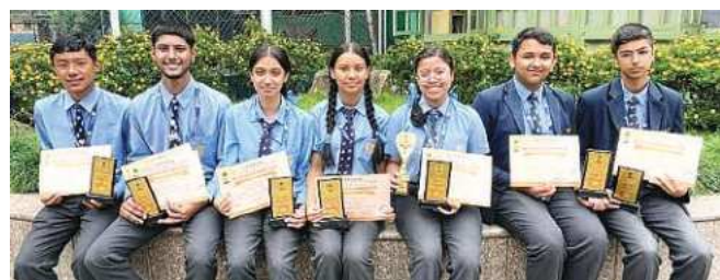
PARTICIPANTS OF THE CONVENTION - TEAM 2