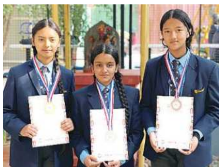
WINNERS OF 3D FLOWER CRAFT