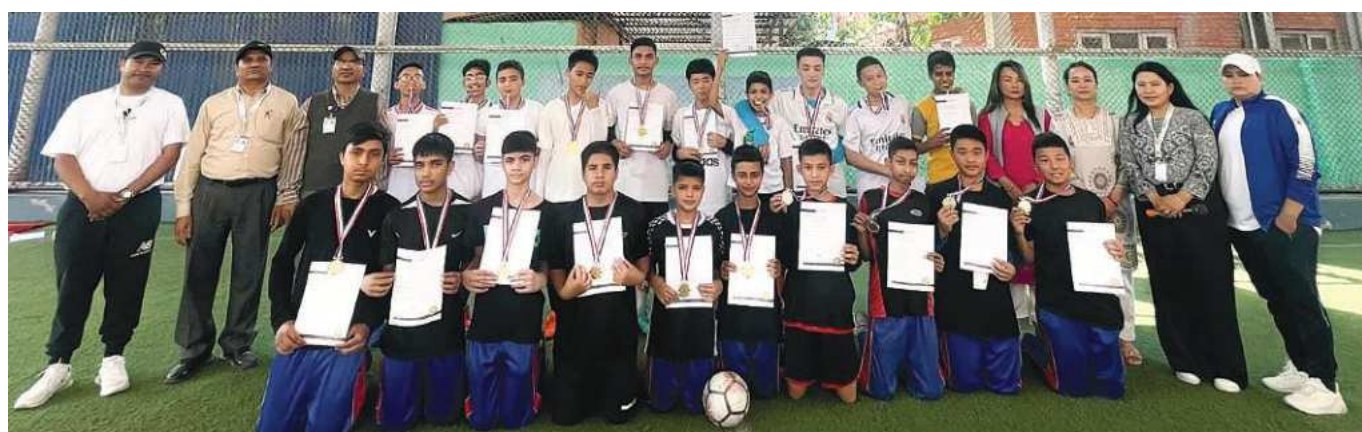
WINNERS OF CLASS 8 – BOYS TEAM