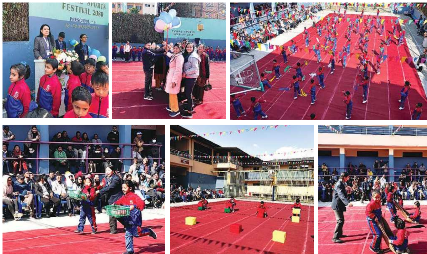
FEW GLIMPSES OF THE ANNUAL SPORTS FESTIVAL 2080 ( PRESCHOOL - CLASS 3)