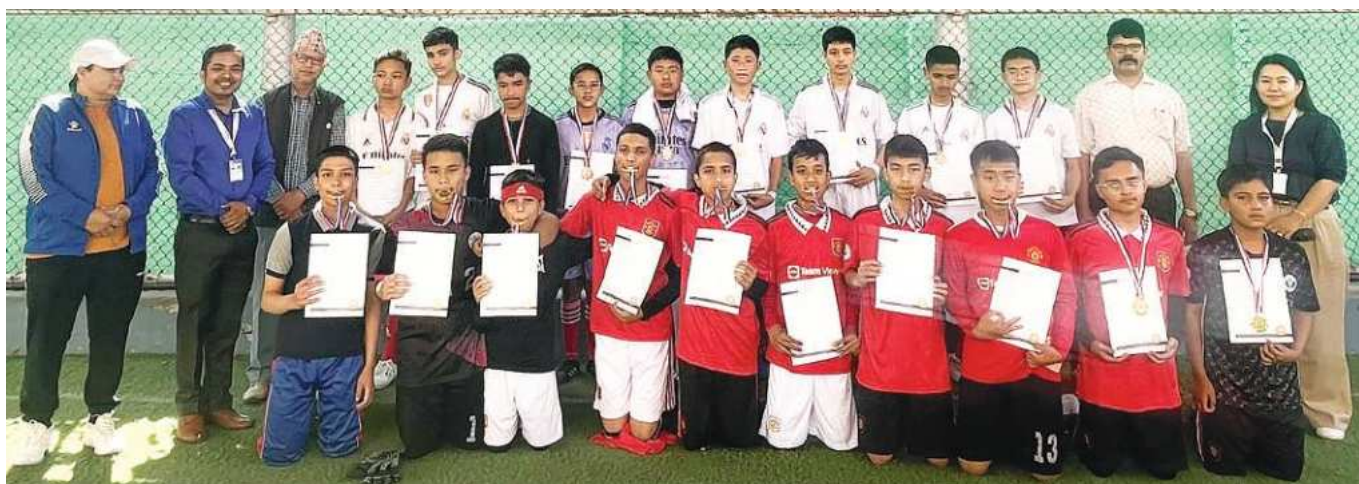
WINNERS OF CLASS 9 – BOYS TEAM