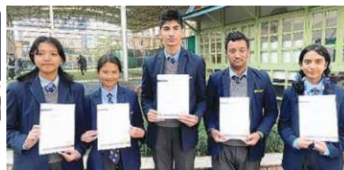
WINNERS OF PANEL DISCUSSION - CLASSES 7-10