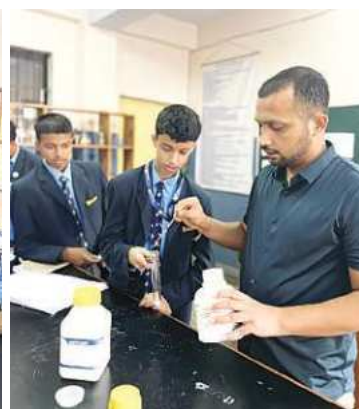
SCIENCE CLASSES ARE EVEN MORE LIVELY WHEN STUDENTS SEE AND LEARN WITH THEIR TEACHER