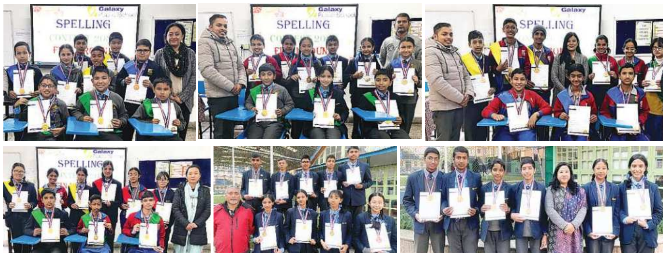
WINNERS OF SPELLING CONTEST 2080 WITH THEIR RESPECTIVE ENGLISH TEACHER (CLASSES 5 – 10)