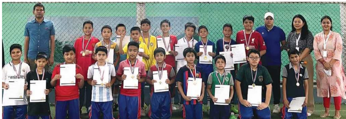
WINNERS OF CLASS 6 – BOYS TEAM