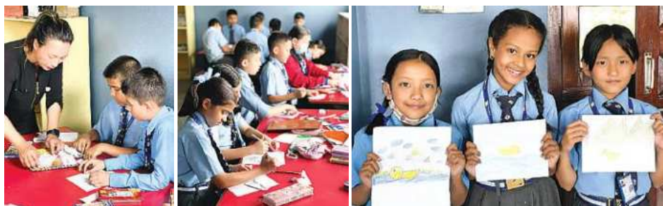
STUDENTS ENJOY ATTENDING PRODUCTIVE ART CLASSES

during their productive are classes. Students from Preschool to class 8 gets to attend the classes every once a week. These classes are very important as it helps in developing motor skills, creativity and presentation skills.