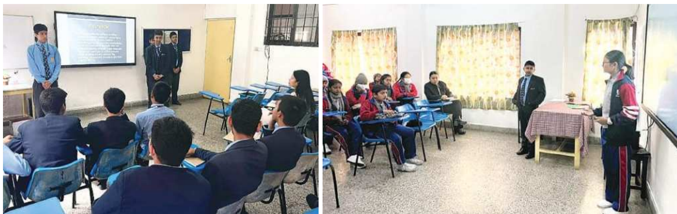
GLIMPSES OF STUDENTS ENGAGED IN CASE STUDY AND PAPER PRESENTATION

Similarly, paper presentation helps student in enhancing the research skills and the ability to search. Presenters learn to communicate their ideas, findings and arguments with the audience. This includes verbal communication, visual aids, and the ability to respond to questions or criticism. There are 6 groups in each class, so every term case study and paper presentation is done on group basis. Various topics are issued to each group and they showcase their presentation followed by question and answer round at the end.