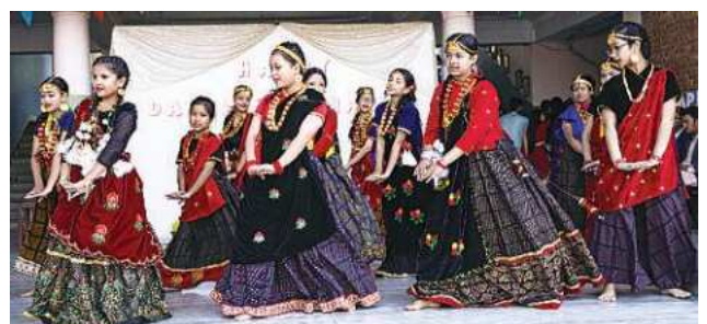
FEW GLIMPSES OF DASHAIN CELEBRATION 2080