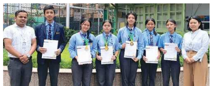
B: WINNERS OF DRAWING COMPETITION