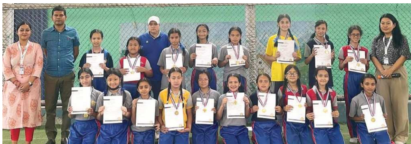
WINNERS OF CLASS 6 – GIRLS TEAM