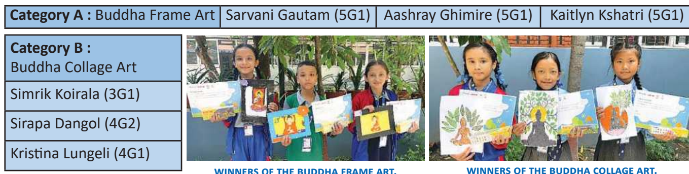
WINNERS OF THE BUDDHA FRAME ART.

On the occasion of Buddha Jayanti, school organized Buddha Jayanti Art Festival on 4 May 2023. All the students from classes 3 to 6 participated in this festival. Top 3 Arts of Category A & B were awarded with certificate and gift. The festival was organized by Pidilite Industries Pvt. Ltd. The best arts of category A and B are listed below:-