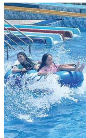
FEW GLIMPSES OF THE VISIT TO THE KATHMANDU FUN VALLEY