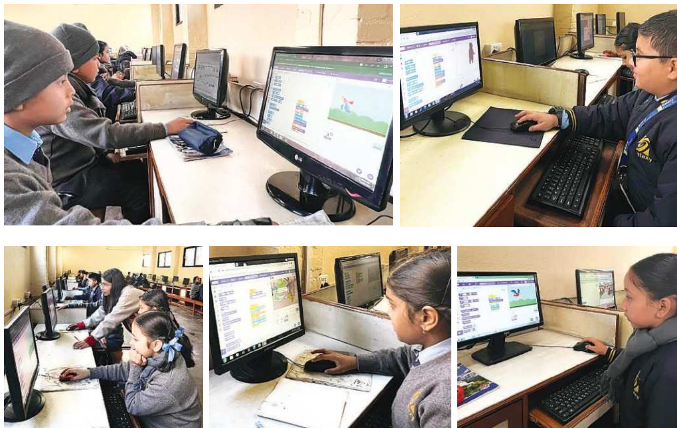
STUDENTS TAKING CODING CLASSES

enhances their math skills, self-confidence, writing skills and decision-making ability. They will be able to understand how computer programs work with the given set of instructions and eventually will be able to develop apps, video games, websites and much more. Students will be learning about Scratch Program, Python, Web designing etc.