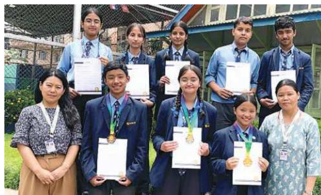
B: WINNERS OF CLAYWORK COMPETITION