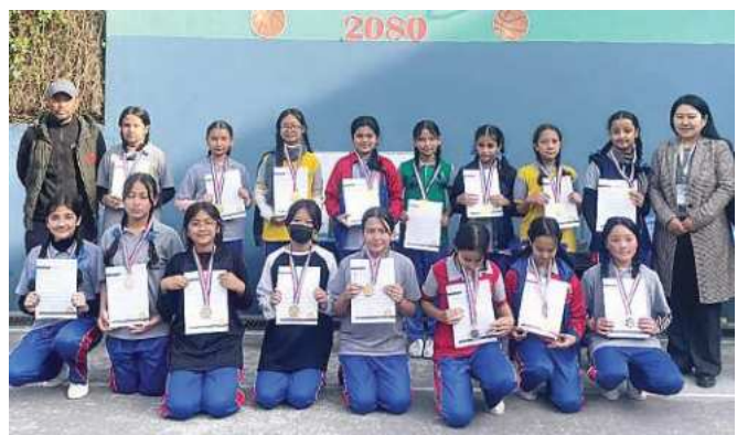
WINNERS OF ANNUAL BASKETBALL TOURNAMENT 2080 - CLASS 6