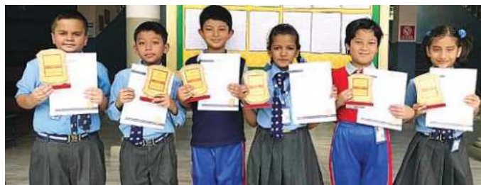
HANDWRITING COMPETITION WINNERS OF CLASS 4