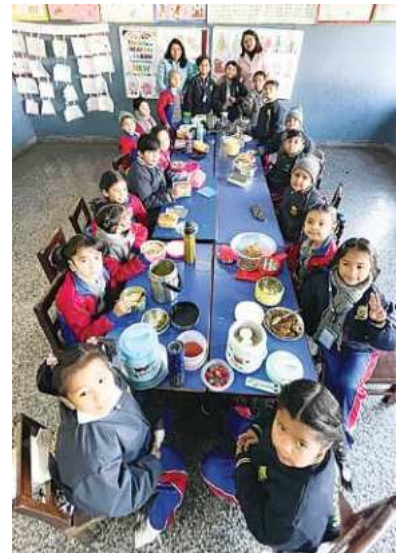
FEW GLIMPSES OF POTLUCK PROGRAM HAPPENING IN THEIR RESPECTIVE LUNCH TIME