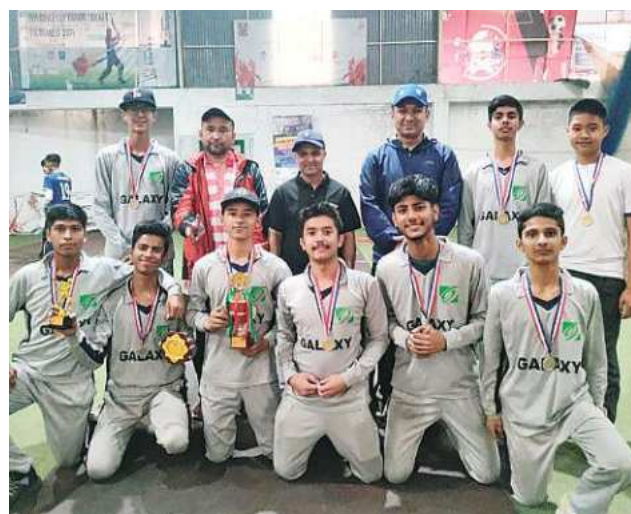
GALAXY CRICKET TEAM AFTER THE AWARD CEREMONY