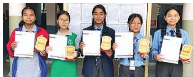
HANDWRITING COMPETITION WINNERS OF CLASS 8