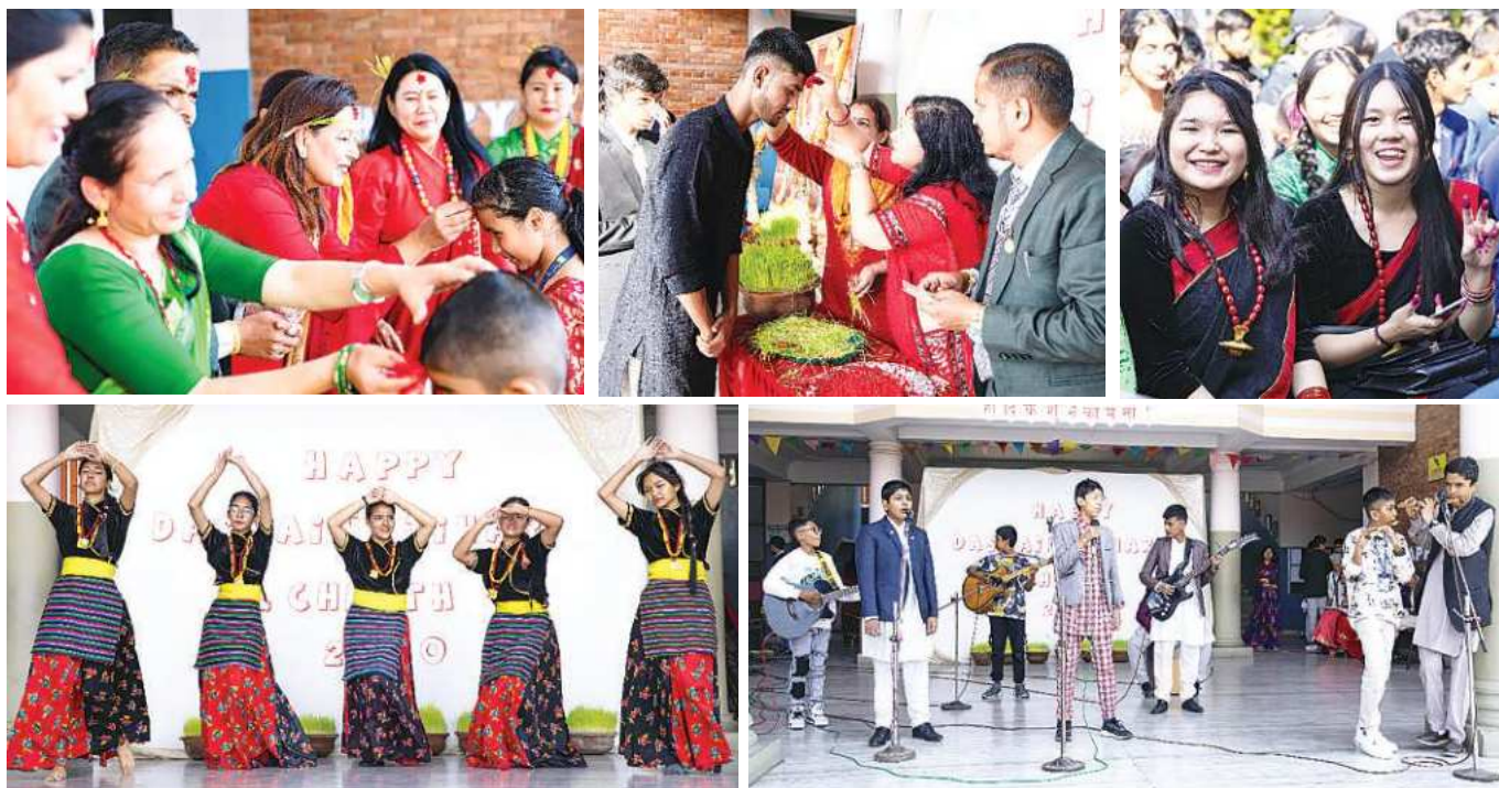
FEW GLIMPSES OF TIKA PROGRAM AND DASHAIN PROGRAM 2080