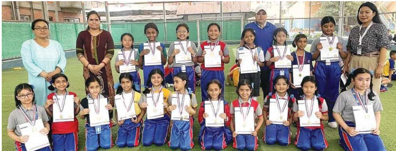
WINNERS OF CLASS 5 – GIRLS TEAM