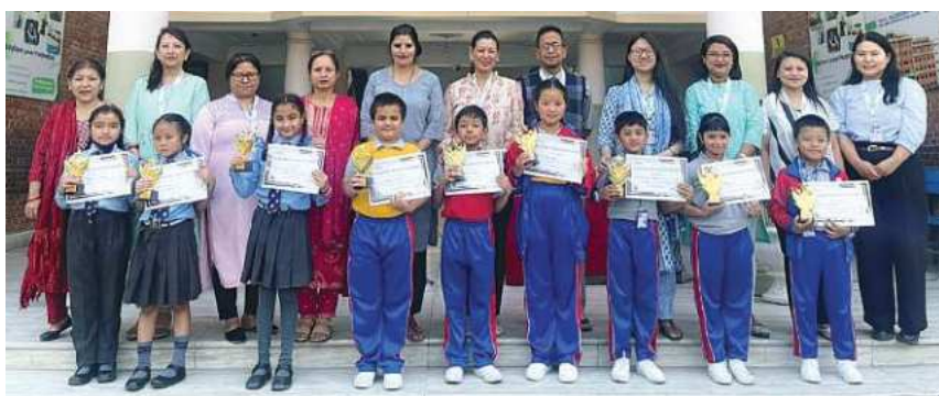
ACADEMIC EXCELLENCE AWARD WINNERS OF CLASSES 1 - 3.