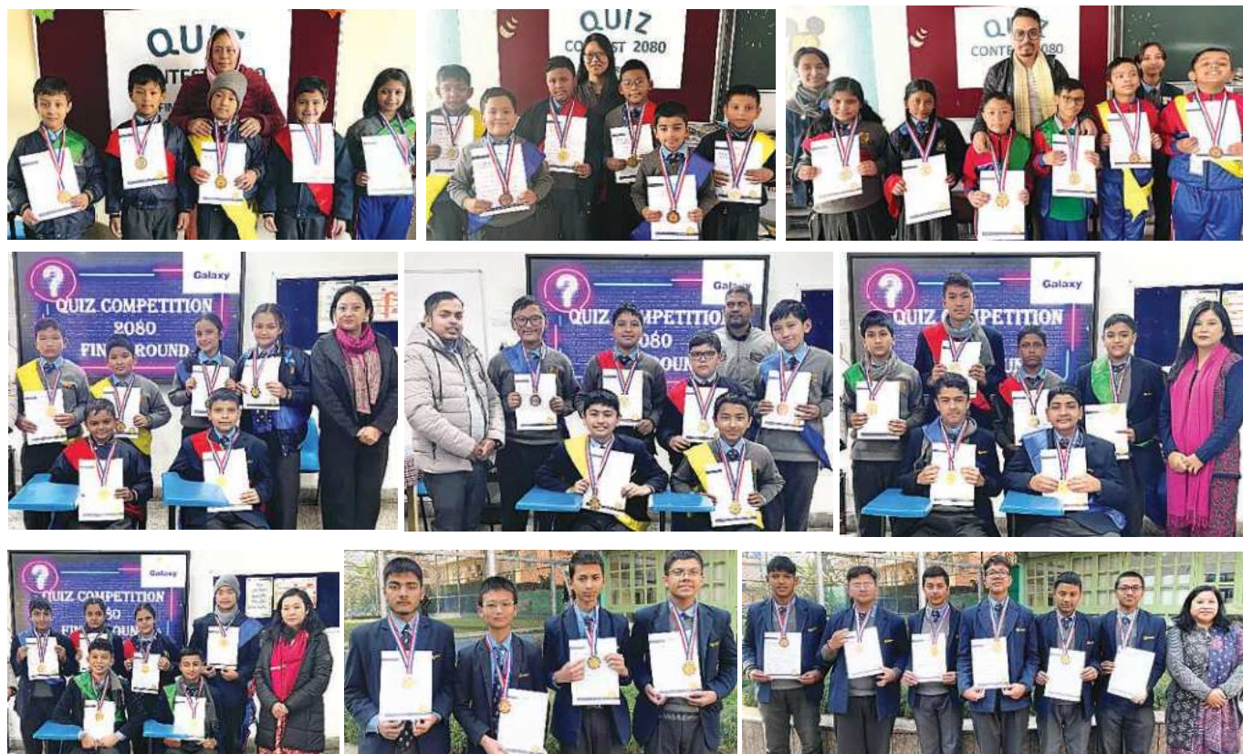
WINNERS OF QUIZ CONTEST WITH THEIR RESPECTIVE ENGLISH TEACHER – CLASSES 2 - 10