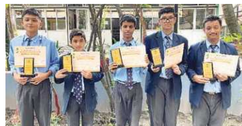
PARTICIPANTS OF THE CONVENTION - TEAM 1