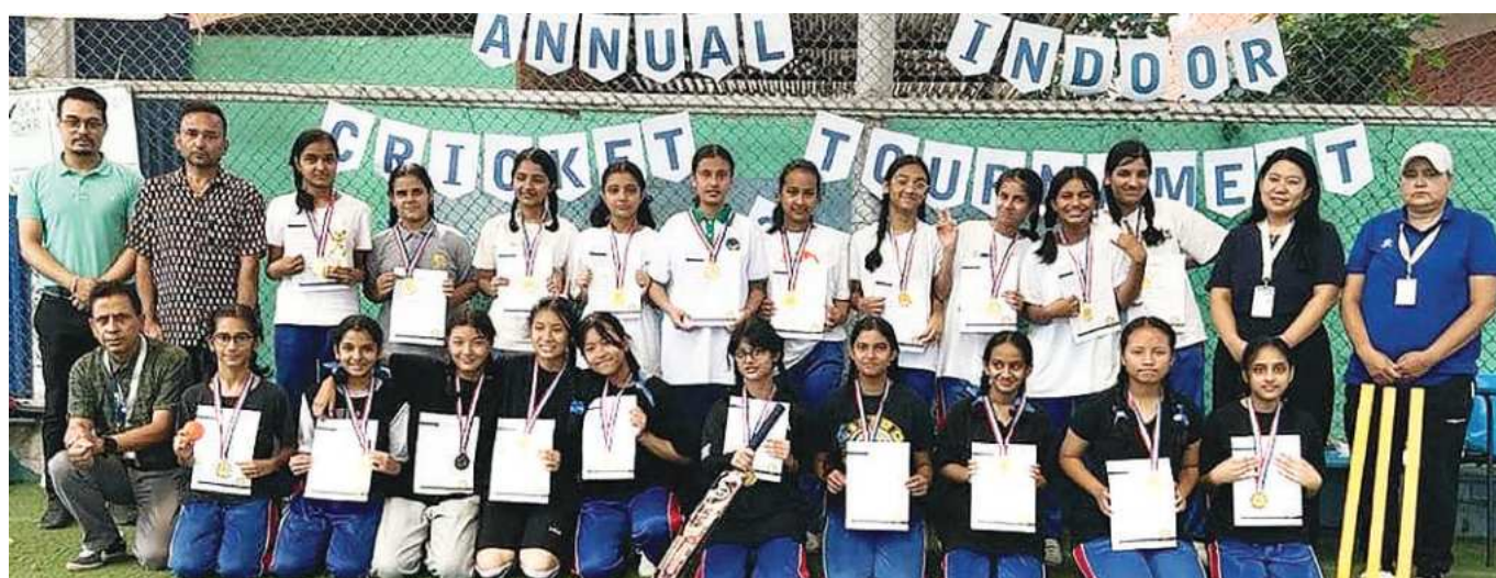
WINNERS OF INDOOR CRICKET TOURNAMENT 2080: MATCH BETWEEN CLASS 7 & 8 - GIRLS