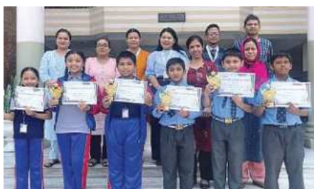
ACADEMIC EXCELLENCE AWARD WINNERS OF CLASSES 4-5.