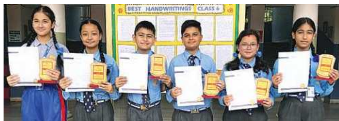
HANDWRITING COMPETITION WINNERS OF CLASS 6