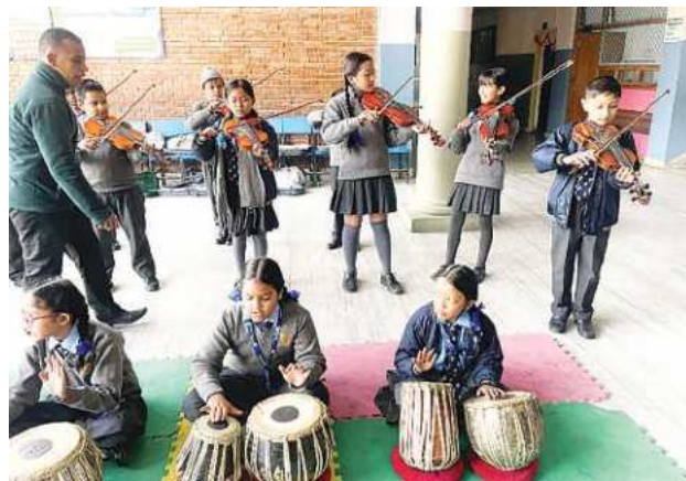
GLIMPSES OF MUSICAL INSTRUMENT EVALUATION (MADAL, TABALA, VIOLIN & FLUTE)