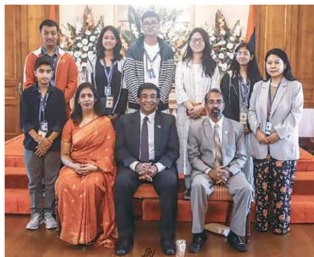
MEETING H. E. PRITHVIRAJESING ROOPUN, PRESIDENT OF MAURITIUS