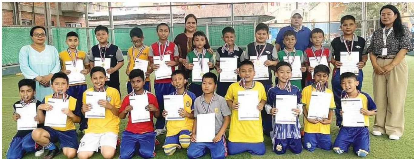
WINNERS OF CLASS 5 – BOYS TEAM