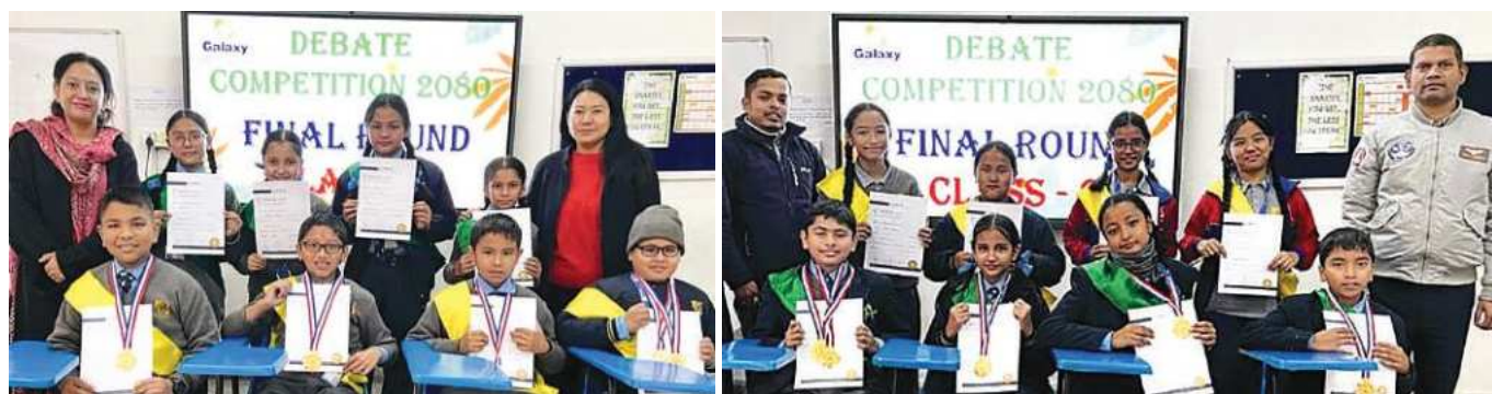
WINNERS OF DEBATE COMPETITION WITH THEIR RESPECTIVE TEACHER – CLASS 5 & 6