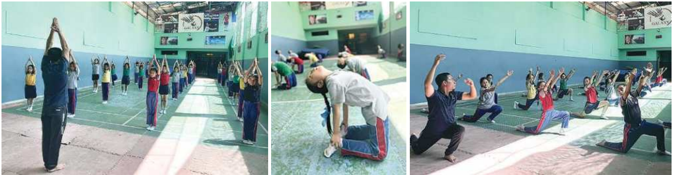
STUDENTS PARTICIPATING IN THE REGULAR GYMNASTIC AND YOGA CLASSES

Gymnastic and Yoga classes are one of the important classes offered to our students. It will build a lifelong foundation for healthy habits for them. Basically, students need a proper direction to channel their energy towards something that would help with their physical and motor development. Therefore, these classes are the perfect solution to develop cognitive function, teach discipline and self-control, provide fitness and strength, and improve perseverance and focus.