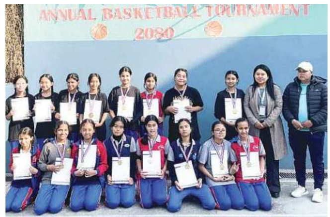
WINNERS OF ANNUAL BASKETBALL TOURNAMENT 2080 - CLASS 7