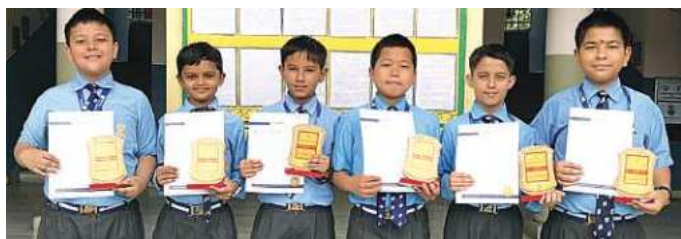
HANDWRITING COMPETITION WINNERS OF CLASS 5