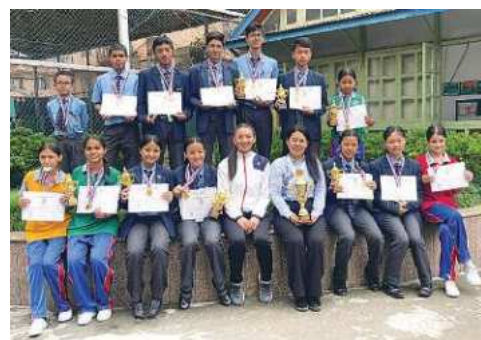
WINNERS OF INTER-SCHOOL BADMINTON TOURNAMENT.