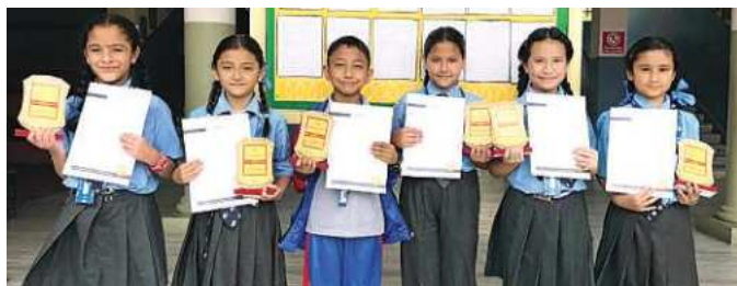
HANDWRITING COMPETITION WINNERS OF CLASS 3