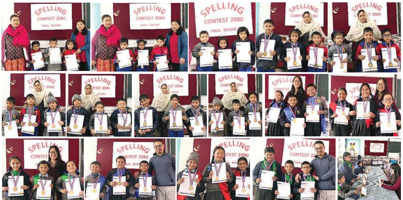
WINNERS OF SPELLING CONTEST 2080 WITH THEIR RESPECTIVE ENGLISH TEACHER (PRESCHOOL – CLASS 4)