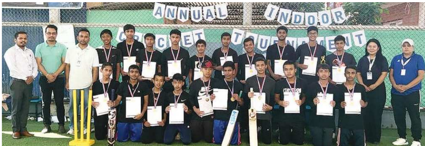
WINNERS OF INDOOR CRICKET TOURNAMENT 2020: MATCH BETWEEN CLASS 9 & 10 - BOYS