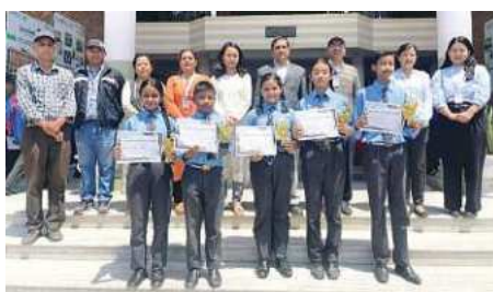
ACADEMIC EXCELLENCE AWARD WINNERS OF CLASSES 6-7.