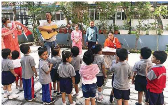
GLIMPSES OF NEPALI AND ENGLISH SONG EVALUATION