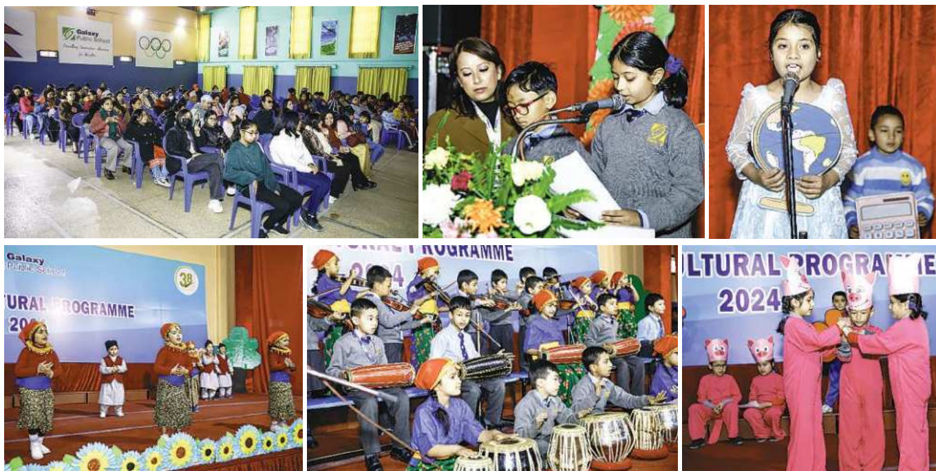
FEW GLIMPSES OF ANNUAL CULTURAL PROGRAMME OF STUDENTS OF PRESCHOOL TO CLASS 2.