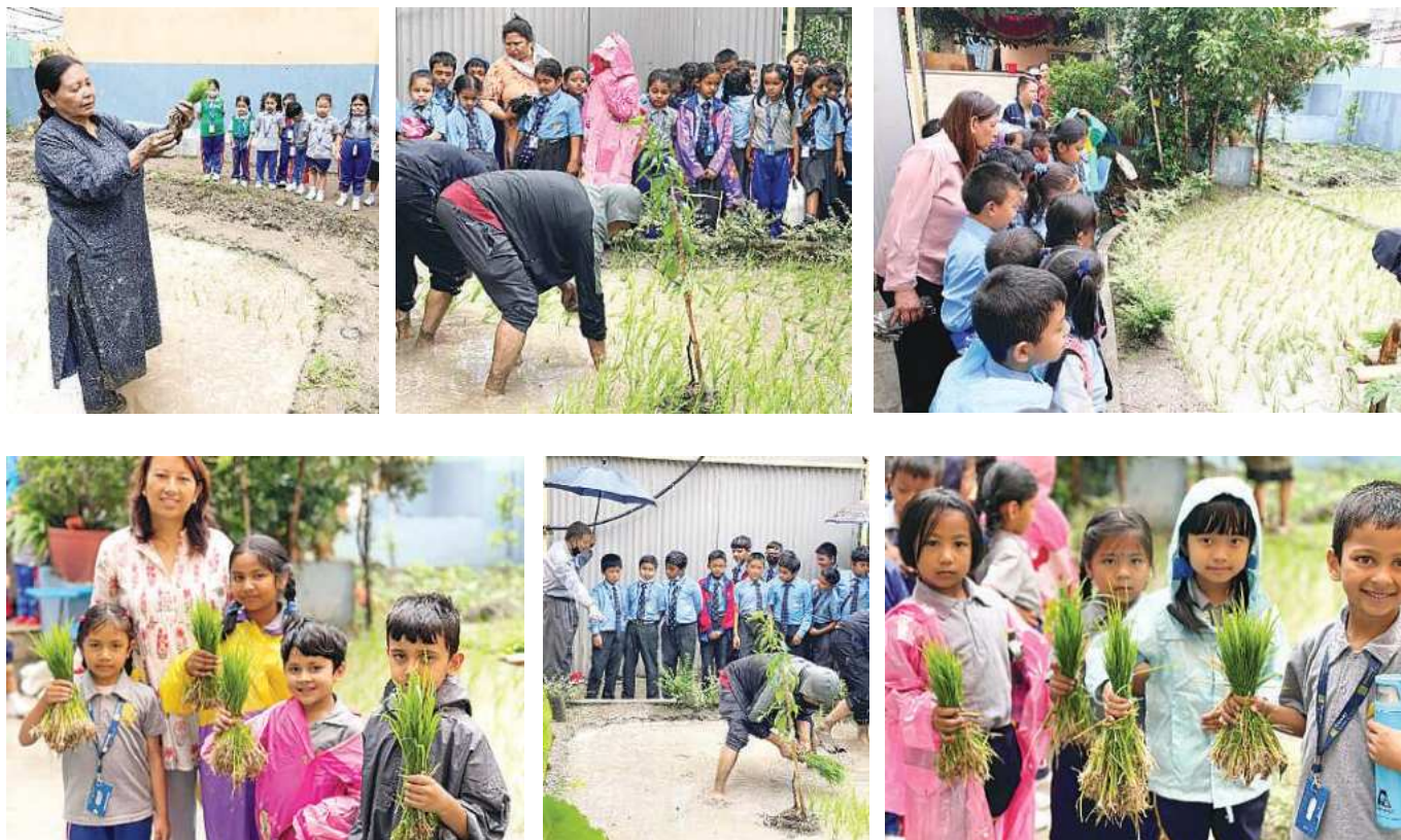
CELEBRATION OF RICE PLANTATION DAY