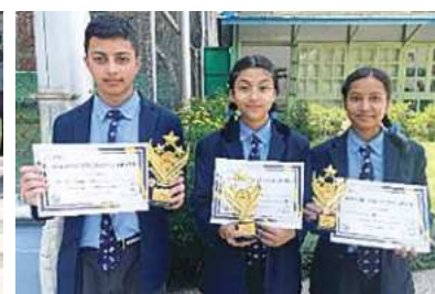
ACADEMIC EXCELLENCE AWARD WINNERS OF CLASS 9.