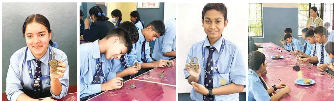
CLAYWORK CLASSES WHERE STUDENTS ARE MAKING CLAY MODEL BAGS.

Students from class Preschool to 8 attend the Claywork classes once a week where they create unique clay projects. These classes are helpful to support students personalized learning, sensory development, fine motor skills, self-esteem, self-expression and problem-solving skills. It instills a sense of discipline and pride in them. Our students work on their imaginary ideas and express them through their work of art. They are thus able to showcase their talents and create interesting outputs during their claywork classes.