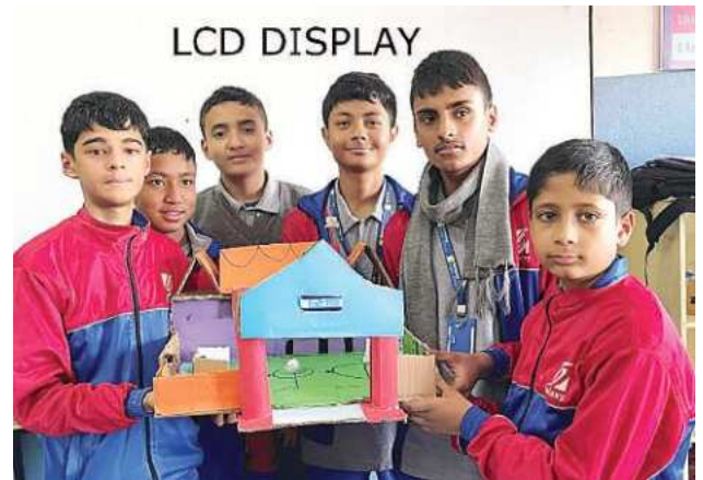
FEW GLIMPSES OF ROBOTIC CLASSES FACILITATED BY ROBO-TECH NEPAL