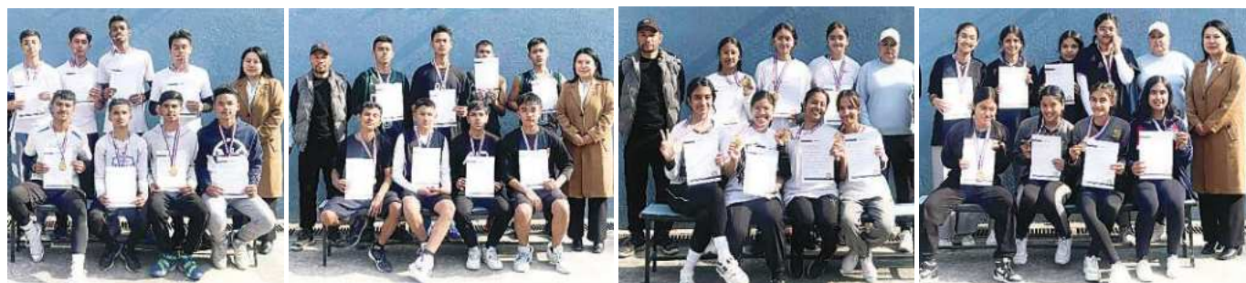
WINNERS OF ANNUAL BASKETBALL TOURNAMENT 2080 - CLASS 10