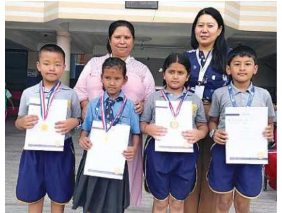
A: WINNERS OF DRAWING COMPETITION