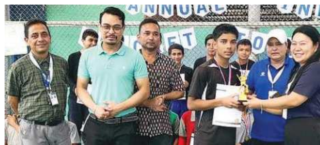
WINNERS OF CLASS 10 GIRLS AND THE WINNERS OF MAN OF THE MATCH