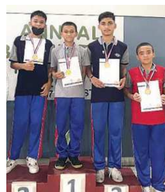
OPENING OF ANNUAL SCHOOL BADMINTON TOURNAMENT 2080 AND THE WINNERS OF CLASS 8