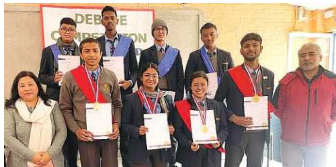
WINNERS OF DEBATE COMPETITION WITH THEIR RESPECTIVE TEACHER - CLASSES 7 - 10