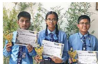
ACADEMIC EXCELLENCE AWARD WINNERS OF CLASS 8.