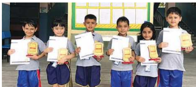
HANDWRITING COMPETITION WINNERS OF CLASS 1