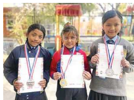
WINNERS OF PAPER FLOWER CRAFT