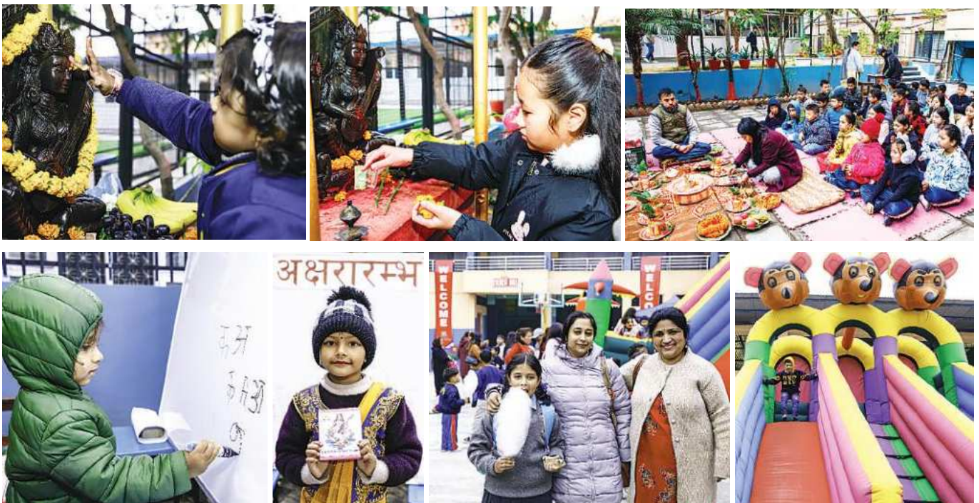
FEW GLIMPSES OF SARASWATI PUJA AND AKSHARAMBHA PROGRAM HELD IN SCHOOL

On this auspicious day, Annual Cultural Programme for students of Preschool, class 1 and 2 were organized to celebrate with our parents, guardians and well-wishers. Students performed various song, musical instrument, dance, English and Nepali play during the program. There was a display of food stall and operation of mini carnival to entertain children.