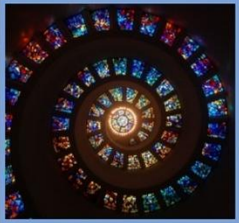
Showing the way to God