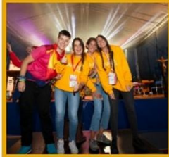
Journeying with Youth