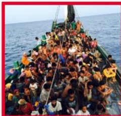
Walking with the Excluded