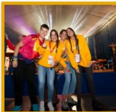
Journeying with Youth