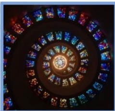
Showing the way to God