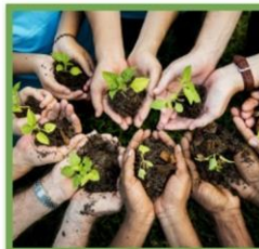
Caring for our Common Home

Phone : 01 5174058, 015174193, Fax: 015174094