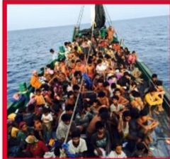
Walking with the Excluded