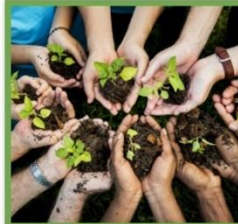
Caring for our Common Home

Phone : 01 5174058, 015174193, Fax: 015174094