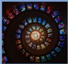
Showing the way to God