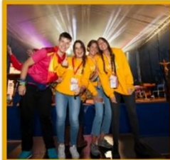
Journeying with Youth